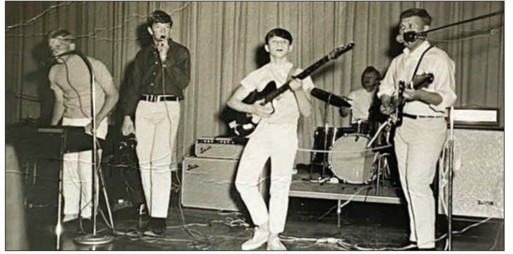
The Court Jesters