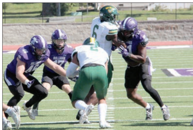
A host of Bulldogs stop Wayne State at the line on Saturday.

The 'Dogs face Upper Iowa on the road next Saturday in a GLVC matchup, which each game will be from here on out. The Peacocks also came from behind last week, overcoming a 20-7 deficit to win 29-28.