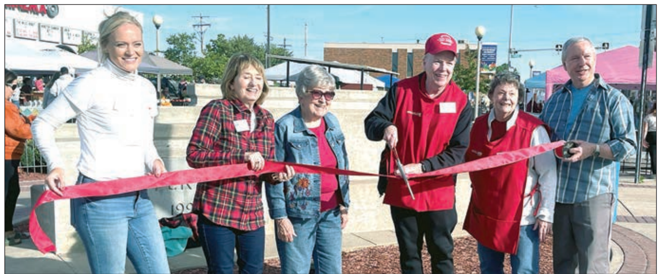
A ribbon-cutting ceremony was held to mark the 50th anniversary of the Red Barn Arts and Crafts Festival

For more information about Project HAPPIE, visit their Facebook page or website ( www.projecthappie.org ) or contact them at sarah@projecthappie.org .