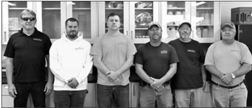
Staff from the Kirksville's wastewater treatment plant.

The wastewater treatment plant treats almost three million gallons of wastewater each day, sending clean water out and protecting the environment, plants, animals and bodies of water.