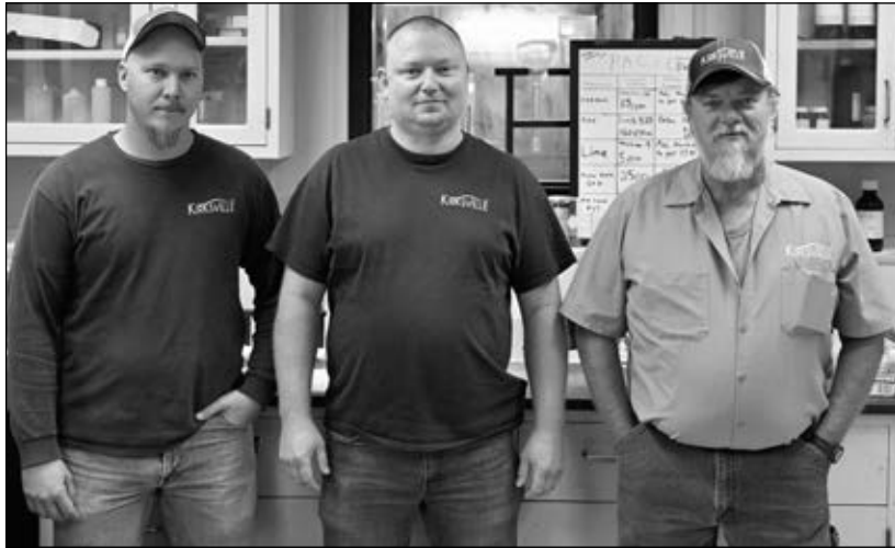
Staff from Kirksville's water treatment plant.

Additionally, there will be other items and packages offered such as “Date Night” theme and “Pamper Package”. There will be a 50/50 raffle and more happening at the event including food and fellowship.