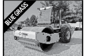
DW2267 '17 Bomag Bw211D-H single drum vibratory roller