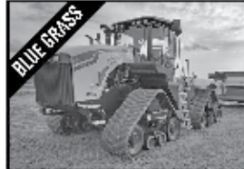
DW2277 '16 M S 3630 14W tractor

425+ ITEMS SELL NO RESERVE! THURSDAY, SEPTEMBER 19