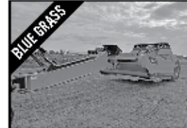
DW2276 '16 MTS M 30 scraper