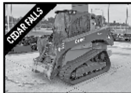
EH4408 24 John Deere 3330 tracked skid steer