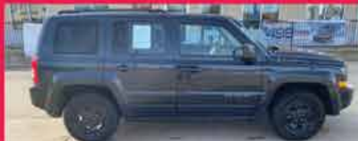
2015 JEEP PATRIOT SPORT FWD, 4 Cyl., Gray