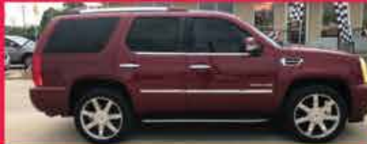
2010 CADILLAC ESCALADE AWD, 8 Cyl., Red