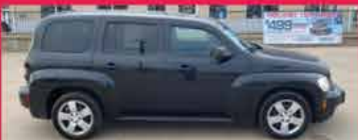
2011 CHEVROLET HHR FWD, 4 Cyl., Black