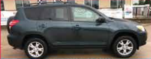
2012 TOYOTA RAV4 BASE, 4WD, 4 Cyl., Black