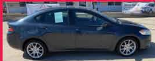
2013 DODGE DART FWD, 4 Cyl., Blue