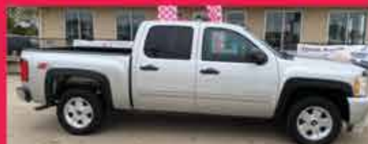
2011 CHEVROLET SILVERADO 1500, LT, 4WD, 8 Cyl., Silver