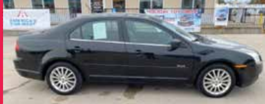
007 MERCURY MILAN AWD, 6 Cyl., black