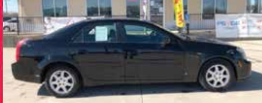
2006 CADILLAC RWD, 6 Cyl., black