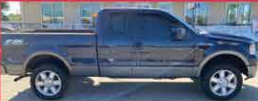
2006 FORD F150 4WD, 8 Cyl., Blue