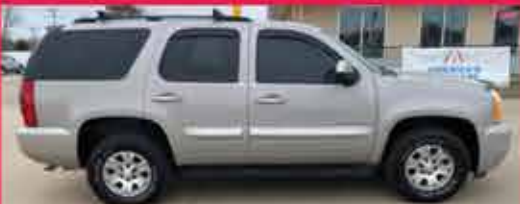
2007 GM YUKON 4WD, 9 Cyl., Gray