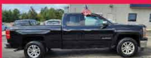
2014 CHEVROLET SILVERADO 1500 LT, 4WD, 8 Cyl., Black