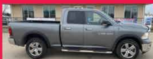
2011 DODGE RAM 1500 4WD, 8 Cyl., Gray