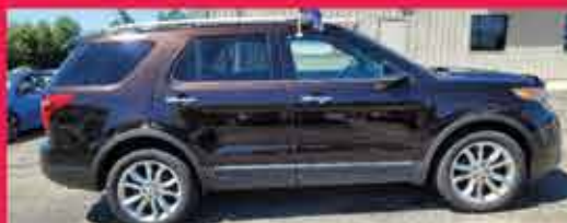
2013 FORD EXPLORER XLT FWD, 6 Cyl., Brown