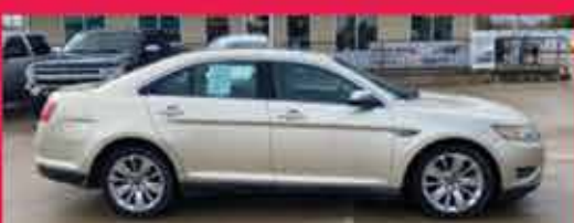
2011 FORD TAURUS UNLIMITED FWD, 6 Cyl., Gold