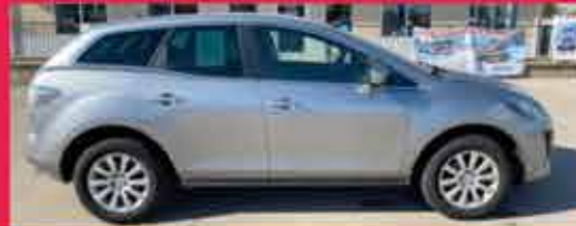
2011 MAZDA CX-7 FWD, 4 Cyl., Silver