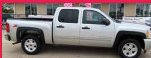
2011 CHEVROLET SILVERADO 1500 LT, 4WD, 8 CYL., 4 DOOR