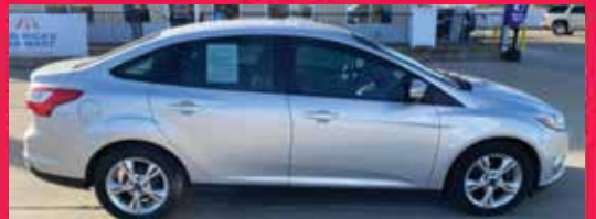
2013 FORD FOCUS SE, FWD, 4 Cyl., Silver