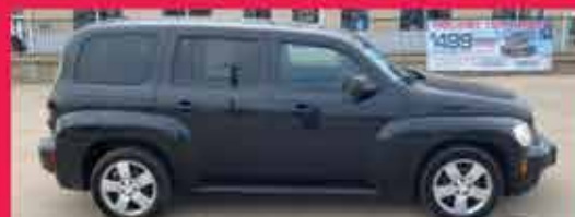
2011 CHEVROLET HHR FWD, 4 Cyl., Black