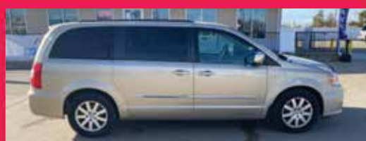
2012 CHRYSLER TOWN & COUNTRY, TOURING L, FWD, 6 CYL.