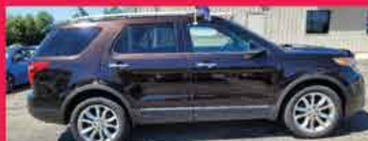
2013 FORD EXPLORER XLT FWD, 6 Cyl., Brown