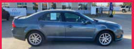
2012 FORD FUSION SEL FWD, 6 Cyl.