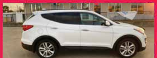
2013 HYUNDAI SANTA FE Sport, FWD, 4 Cyl., White