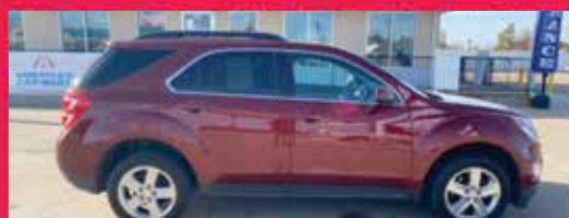
2016 CHEVROLET EQUINOX LT, 4WD, 4 Cyl., Maroon