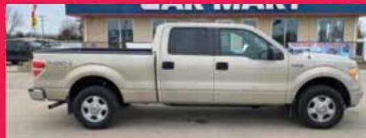
2010 FORD F150 4WD, 8 Cyl., Gold