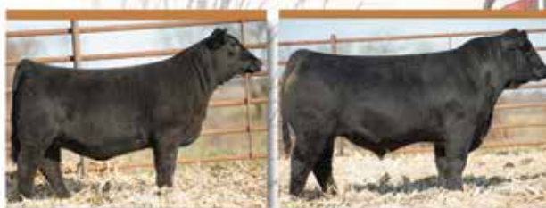
She sells, ASA 3974891