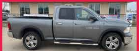
2011 DODGE RAM 1500 4WD, 8 Cyl., Gray