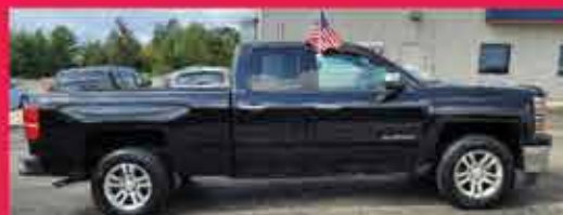
2014 CHEVROLET SILVERADO 1500 LT, 4WD, 8 Cyl., Black