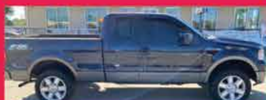
2006 FORD F150 4WD, 8 Cyl., Blue