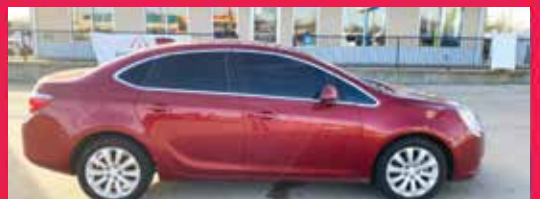
2016 BUICK VERANO FWD, 4 Cyl.