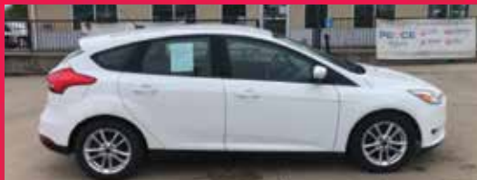
2015 FORD FOCUS SE FWD, 4 Cyl.