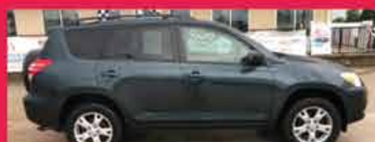
2012 TOYOTA RAV4 4WD, 4 Cyl., Black