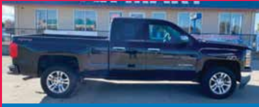
2014 CHEVROLET SILVERADO 1500 4WD, 8 CYL., BLACK