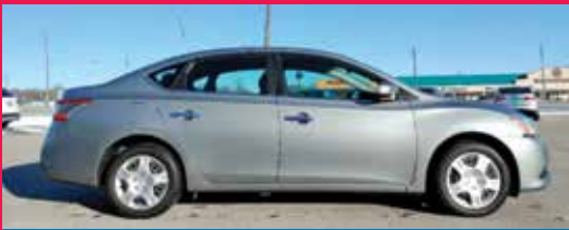
2013 NISSAN SENTRA FWD, 4 Cyl., Gray