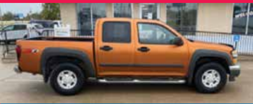
2004 CHEVROLET COLORADO RWD, 5 Cyl., Orange