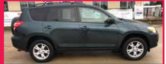
2012 TOYOTA RAV4 4WD, 4 Cyl., Black