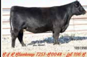
B A R Bluecap 7251-80048 - lot 106 B

Selling buyer's choice of two flush sisters to the dam of the $140,000 B A R Dynamic including the female whose 2021 son had an adjusted %IMF of 9.98% to surpass his contemporaries by more than 2.00%.