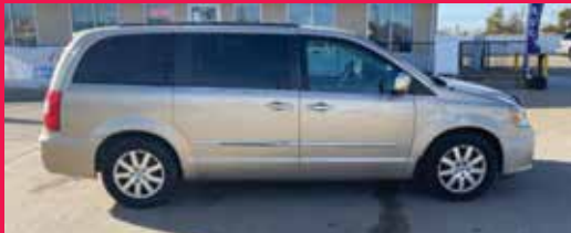
2012 CHRYSLER TOWN & COUNTRY FWD, 6 CYL.