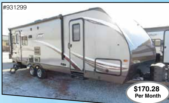
2017 Coleman Light 2605RL Large Slide-Out