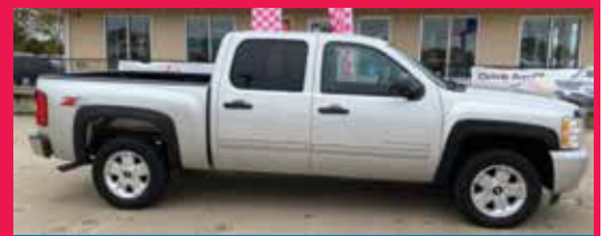
2011 CHEVROLET SILVERADO 1500 4WD, 8 Cyl., Silver, 4 Doors