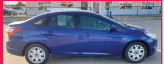
2012 FORD FOCUS FWD, 4 Cyl., Blue