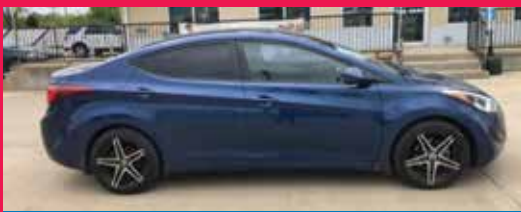
2016 HYUNDAI ELANTRA FWD, 4 Cyl., Blue