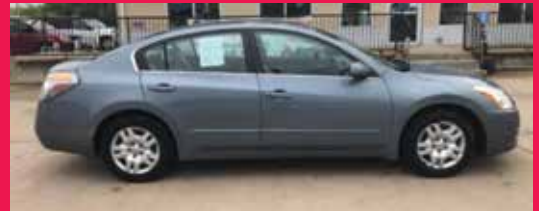
2010 NISSAN ALTIMA FWD, 4 Cyl., Blue