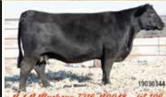
B A R Bluecap 7216-80048 - lot 106 A

Selling buyer's choice of two flush sisters to the dam of the $140,000 B A R Dynamic including the female whose 2021 son had an adjusted %IMF of 9.98% to surpass his contemporaries by more than 2.00%.