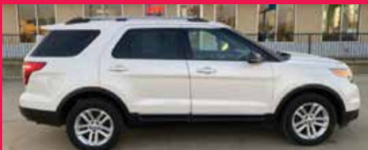
2013 FORD EXPLORER FWD, 4 Cyl., White