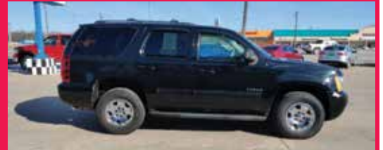
2011 TAHOE 4WD, 8 Cyl., Black