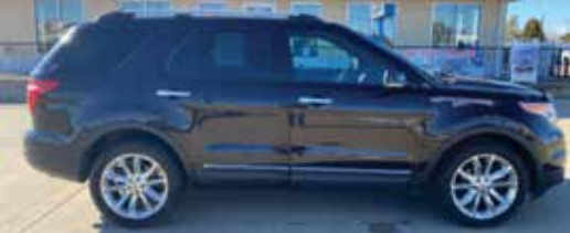
2013 FORD EXPLORER FWD, 6 Cyl., Brown