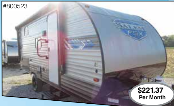
2022 Salem FSX 178BHSK Slide-Out