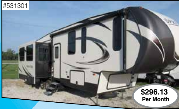
2018 Keystone Sprinter 297FWRLS 3 Slide-Outs