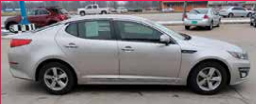
2015 KIA OPTIMA FWD, 4 Cyl., Silver

660-956-4849 • 2015 North Baltimore • Kirksville