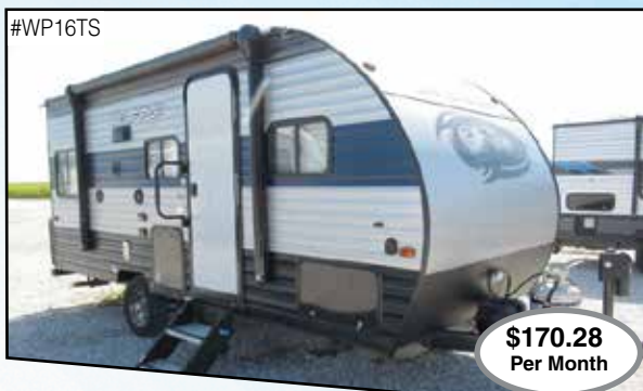
2020 Cherokee Wolf Pup 16TS Easy to Tow