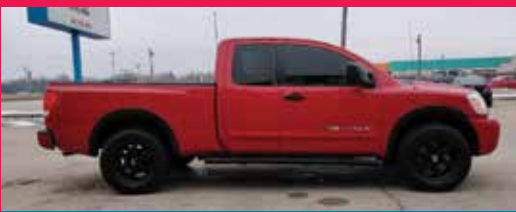
2010 NISSAN TITAN PRO-4X , 4WD, 8 Cyl., Red