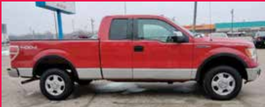
2010 FORD F150 FWD, 8 Cyl., Red