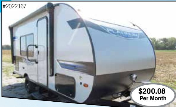
2022 Salem FSX 167RBK Rear Bathroom