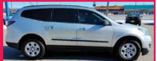
2015 CHEVROLET TRAVERSE FWD, 6 Cyl, Silver