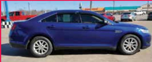
2014 FORD TAURUS FWD, 6 Cyl., Blue