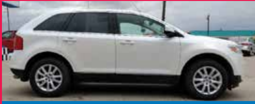
2011 FORD EDGE LIMITED FWD, 6 Cyl., White