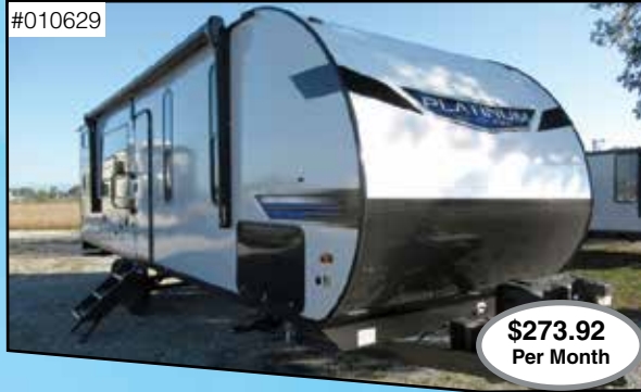
2022 Salem FSX 270RTK MAX Toy Hauler