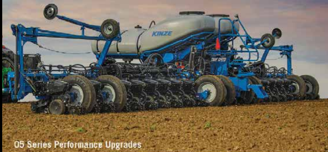
05 Series Performance Upgrades

Spend less time in the shop and more time in the field with the 05 series performance upgrades. Double the acres between service intervals with upgrades to row unit wear points for improved durability and ease of maintenance. Enhanced seed delivery system plants more crop types, seed sizes, and increases speed.