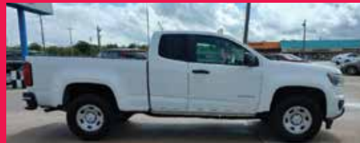
2019 CHEVROLET COLORADO RWD, 4 Cyl., White