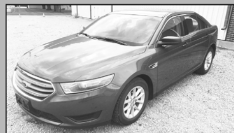
2014 TAURUS, ONLY 91,536 MILES