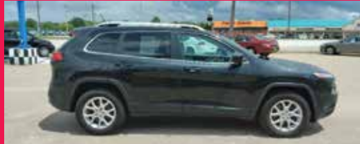
2014 JEEP CHEROKEE 4WD, 4 Cyl., Black