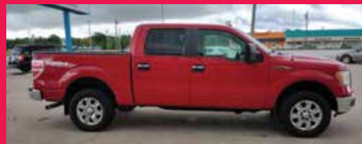
2010 FORD F150 4WD, 8 Cyl., Red.