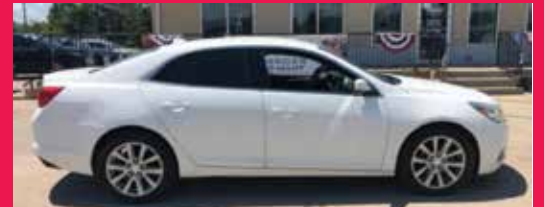
2014 CHEVROLET MALIBU FWD, 4 Cyl., White