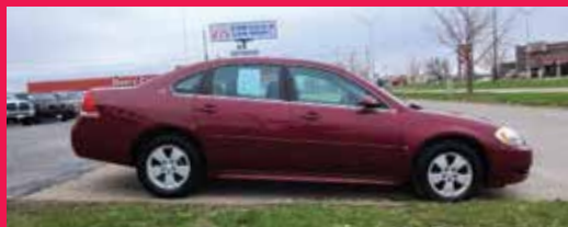
2009 CHEVROLET IMPALA FWD, 6 Cyl., Maroon