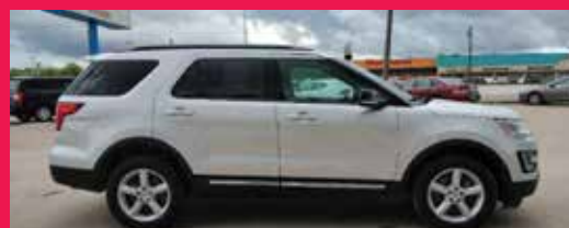
2017 FORD EXPLORER, 4WD, 6 Cyl., Silver