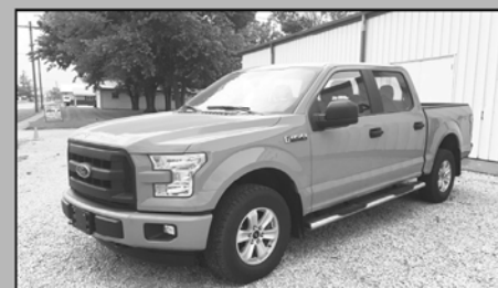
2015 F150, ONLY 45,778 MILES