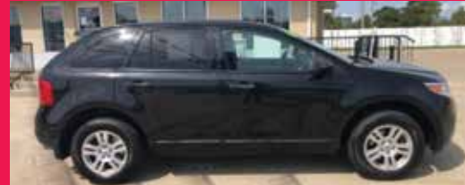
2013 FORD EDGE FWD, 6 Cyl., BLACK