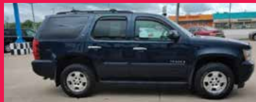
2008 CHEVROLET TAHOE 4WD, 8 Cyl., Blue