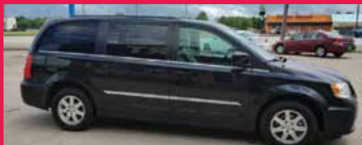
2013 CHRYSLER TOWN & COUNTRY TOURING FWD, 6 Cyl., Black