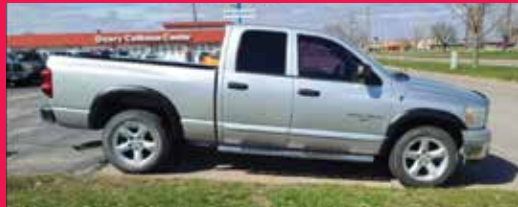
2007 DODGE RAM 1500 RWD, 8 Cyl., Silver