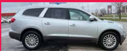
2010 BUICK ENCLAVE, FWD, 6 Cyl., Silver

660-956-4849 • 2015 North Baltimore • Kirksville