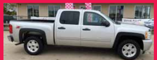
2011 CHEVROLET SILVERADO 1500 4WD, 8 Cyl., Silver, 4 Doors