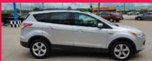
2013 FORD ESCAPE FWD, 4 Cyl., Silver