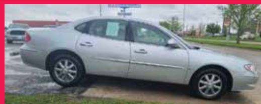
2009 BUICK LACROSSE FWD, 6 Cyl., Silver