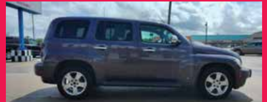
2007 CHEVROLET HHR FWD, 4 Cyl., Purple