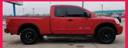
2010 NISSAN TITAN PRO 4WD, 8 Cyl., RED