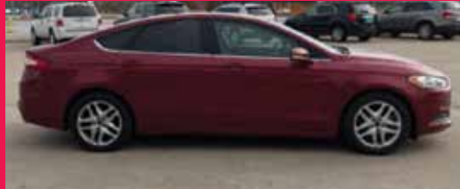
2015 FORD FUSION FWD, 4 Cyl., Red