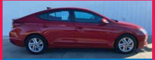
2020 HYUNDAI ELANTRA FWD, 4 CYL., RED