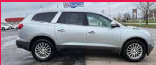
2010 BUICK ENCLAVE FWD, 6 Cyl., Silver

660-956-4849 • 2015 North Baltimore • Kirksville