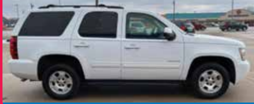
2014 CHEVROLET TAHOE RWD, 8 Cyl., White