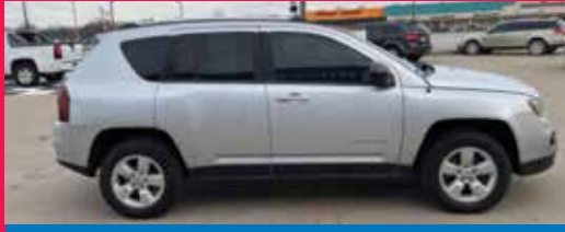
2014 JEEP COMPASS FWD, 4 Cyl., Silver