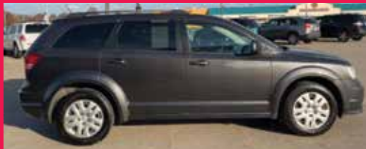
2017 DODGE JOURNEY FWD, 4 Cyl., Gray