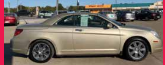
2010 CHRYSLER SEBRING FWD, 6 CYL., GOLD