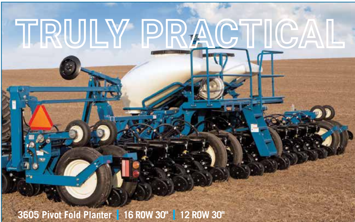
3605 Pivot Fold Planter | 16 ROW 30" | 12 ROW 30"