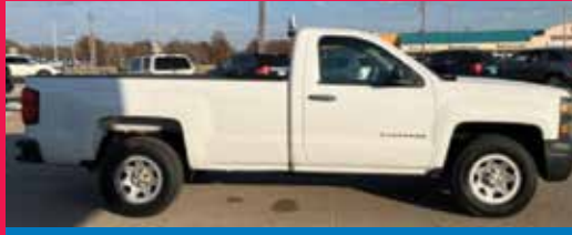
2014 CHEVROLET SILVERADO 1500 RWD, 6 Cyl., White