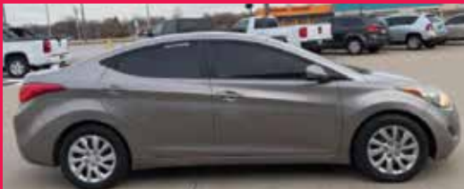
2011 HYUNDAI ELANTRA FWD, 4 Cyl., Gray