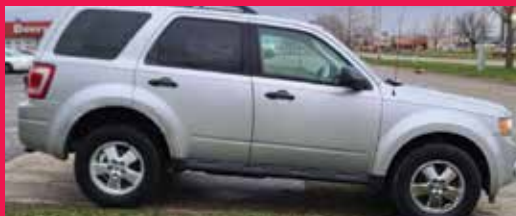
2011 FORD ESCAPE FWD, 6 Cyl., Silver