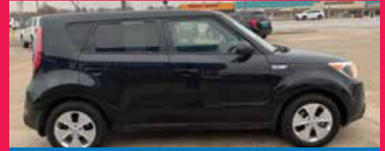
2016 KIA SOUL FWD, 4 Cyl., Black