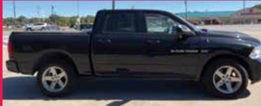
2012 RAM 1500 4WD, 8 Cyl., Black