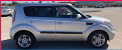
2011 KIA SOUL FWD, 4 Cyl., Silver