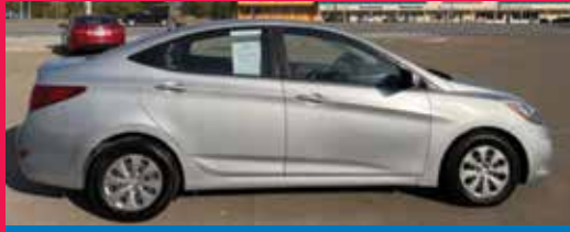
2016 HYUNDAI ACCENT FWD, 4 Cyl., Silver