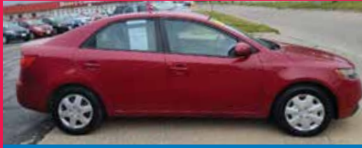
2013 KIA FORTE FWD, 4 Cyl., Red