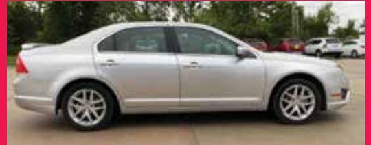
2012 FORD FUSION FWD, 4 Cyl., Silver