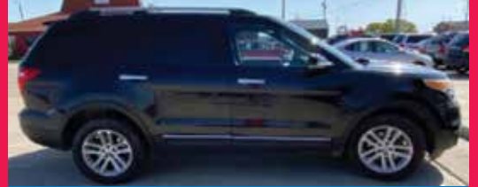
2011 FORD EXPLORER FWD, 6 Cyl., Black