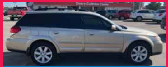
2008 SUBARU OUTBACK AWD, 4 Cyl., Tan