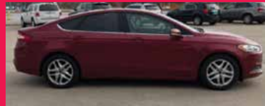
2015 FORD FUSION FWD, 4 Cyl., Red