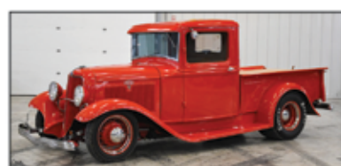
'34 FORD PICKUP