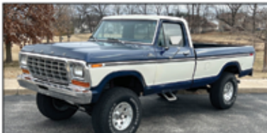
'79 FORD F-150 4X4 PICKUP