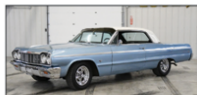
'64 CHEVY IMPALA SS