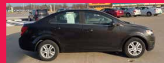
2015 CHEVY SONIC FWD, 4 Cyl., Gray