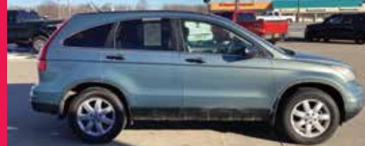
2011 HONDA CR-V 4WD, 4 Cyl., Green