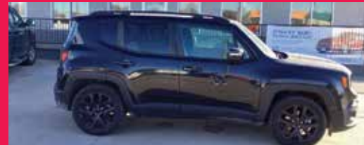
2018 JEEP RENEGADE FWD, 4 Cyl., Black