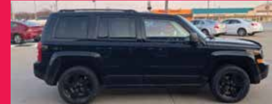
2015 JEEP PATRIOT SPORT FWD, 4 Cyl., Black