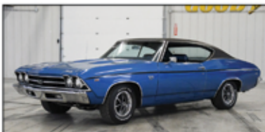
'69 CHEVELLE SS 4 SP.