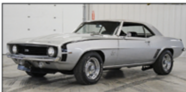
'69 CAMARO SS 4 SP.