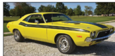
'72 DODGE CHALLENGER