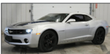
'10 CHEVY CAMARO RS