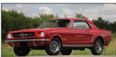
'65 FORD MUSTANG 4 SP.