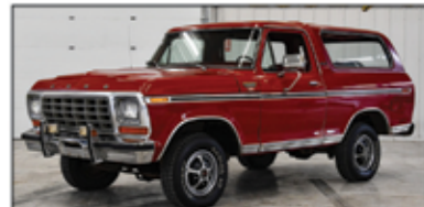
'78 FORD BRONCO XLT 4X4