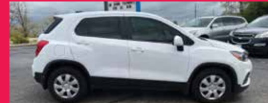
2018 CHEVY TRAX FWD, 4 Cyl., White