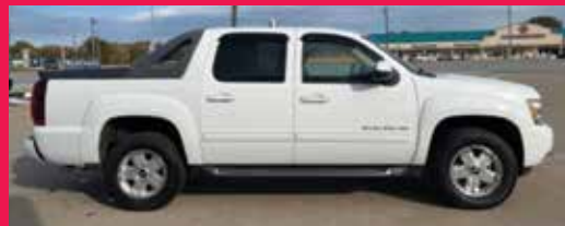
2012 CHEVY AVALANCHE 4WD, 8 Cyl., White