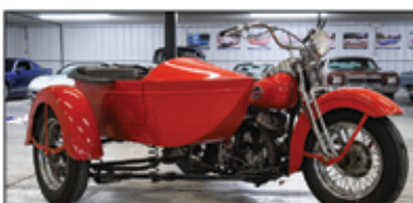
'42 HARLEY DAVIDSON