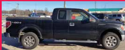
2010 FORD F150 4WD, 8 Cyl., Black