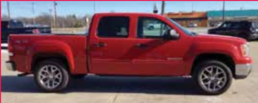
2011 GMC SIERRA 1500 4WD, 8 Cyl., 4 doors, Red