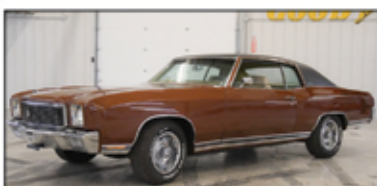
'71 CHEVY MONTE CARLO