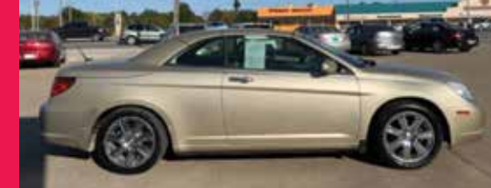
2010 CHRYSLER SEBRING FWD, 6 Cyl., Gold