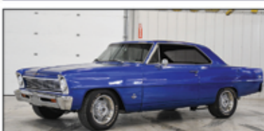
'66 CHEVY NOVA II SS 4 SP.