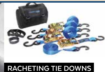
RACHETING TIE DOWNS