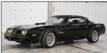
'78 PONTIAC TRANS AM