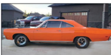
'69 HEMI ROAD RUNNER 4 SP.