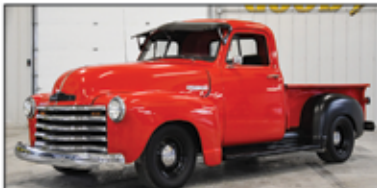
'53 CHEVY 3100 PICKUP