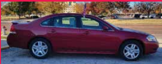
2012 CHEVY IMPALA FWD, 6 Cyl., MAROON