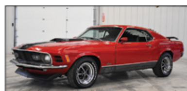
'70 MUSTANG MACH 1 4 SP.