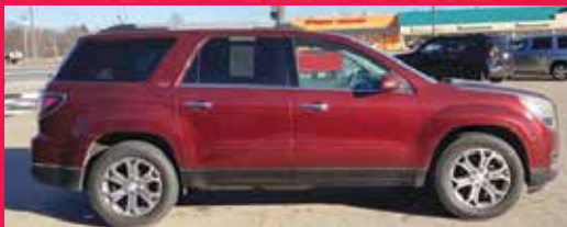
2015 GMC ACADIA AWD, 6 Cyl., Maroon

660-956-4849 • 2015 North Baltimore • Kirksville