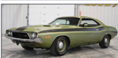
'73 DODGE CHALLENGER 4 SP.