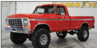
'79 FORD F350 4X4 PICKUP