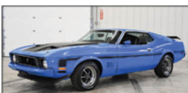
'73 FORD MUSTANG MACH 1