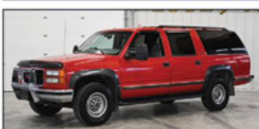
'99 GMC 4X4 SUBURBAN