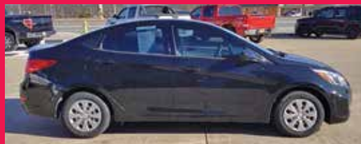
2017 HYUNDAI ACCENT fwd, 4 Cyl, Black