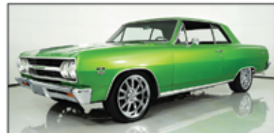
'65 CHEVY MALIBU SS