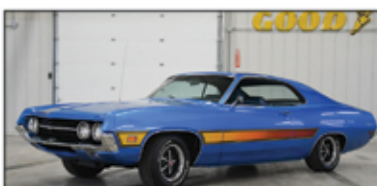
'70 FORD FAIRLANE 500