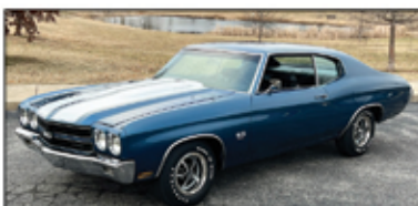
'70 CHEVY CHEVELLE LS6