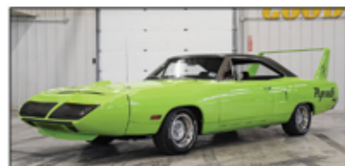
'70 PLYMOUTH 4 SP. SUPERBIRD

Vehicles will be housed and available for pre-auction inspection at Sullivan's Carthage, IL facility, 1204 Buchanan Street. Carthage, IL is located approximately 10 miles east of Sullivan Auctioneers Hamilton, IL facility on Hwy. 136. All items will be photographed and described for the online bidding catalog. Sullivan Auctioneers' Carthage facility will be open for viewing the entire week prior to the auction, beginning on Monday, February 13th - Sunday, February 19th. Viewing will be from 9:00 AM - 3:00 PM each day. Phone (844) 847-2161.