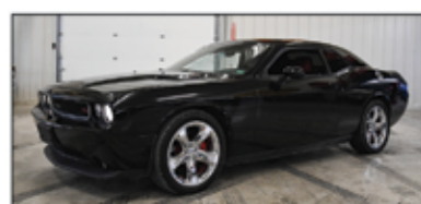
'14 DODGE CHALLENGER R/T