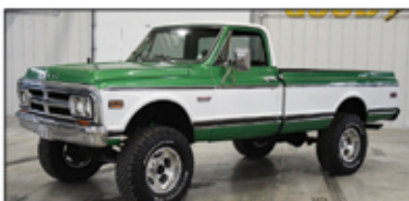
'69 GMC K1500 4X4