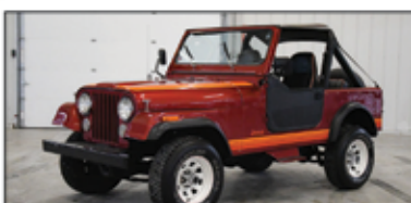
'85 JEEP CJ7 SPRING SPECIAL