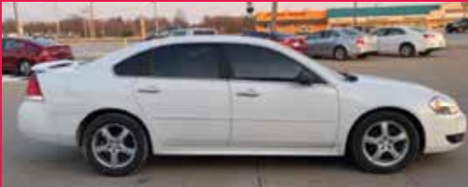
2010 CHEVY IMPALA FWD, 6 Cyl., White