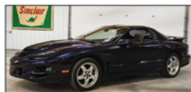
'01 PONTIAC TRANS AM WS6