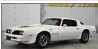
'77 PONTIAC TRANS AM 4 SP.