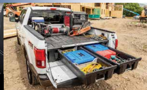
DECKED Drawer Systems