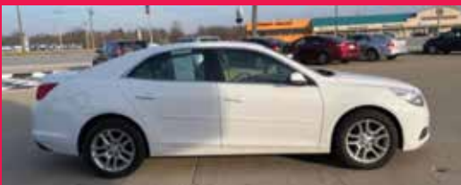
2013 CHEVY MALIBU FWD, 4 Cyl., Silver