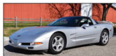
'97 CHEVY CORVETTE