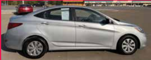
2016 HYUNDAI ACCENT FWD, 4 Cyl., Silver