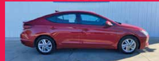
2020 HYUNDAI ELANTRA FWD, 4 Cyl., Red