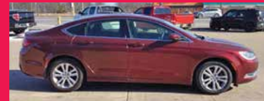
2015 CHRYSLER 200 FWD, 4 Cyl., Maroon