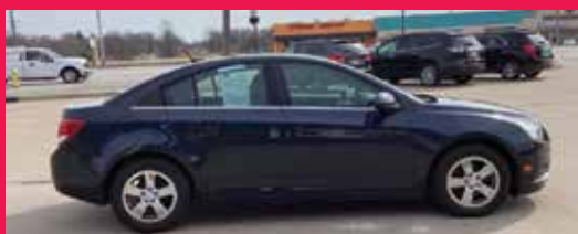
2014 CHEVY CRUZE FWD, 4 Cyl., Blue