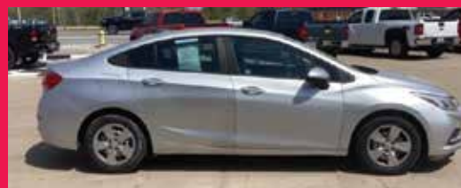
2016 CHEVY CRUZE FWD, 4 Cyl., White