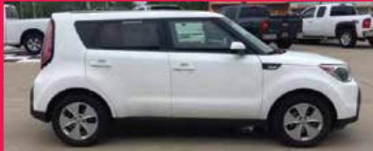
2014 KIA SOUL FWD, 4 CYL., WHITE