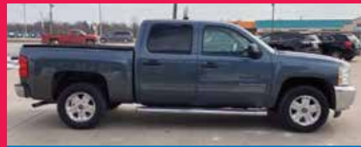
2012 SILVERADO 1500 4WD, 8 Cyl., Blue