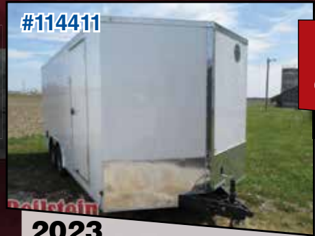
#114411 2023 Darkhorse Cargo 8.5X18 TANDEM AXLES

NEW, Loaded Up, Two-Tone, Aluminum Wheels