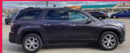
2015 GMC ACADIA AWD, 4 Cyl., Purple