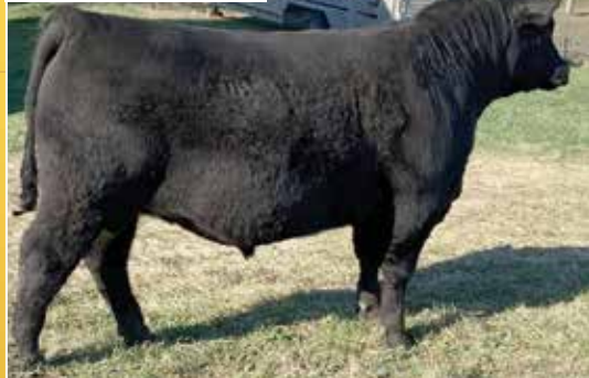
Lot 9 - BTC Treasure 212

BTC Treasure 212 Born: 02-06-2022 Bull 20441937 #*V A R Discovery 2240 #*MGR Treasure #*S J H Impression of 6108 1614 #*Barstow Cash BTC Kirsten 804 GW Kirsten 410