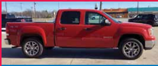
2011 GMC SIERRA 1500 4WD, 8 Cyl., 4 doors, Red