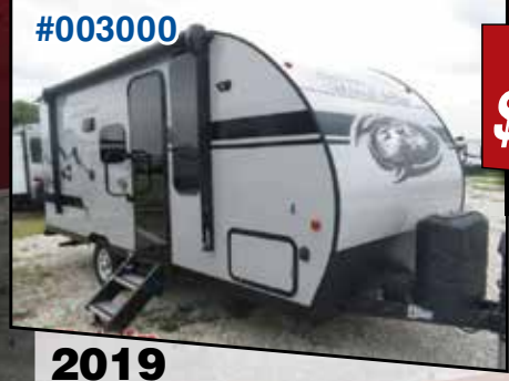
#003000 2019 Cherokee Wolf Pup 16PF