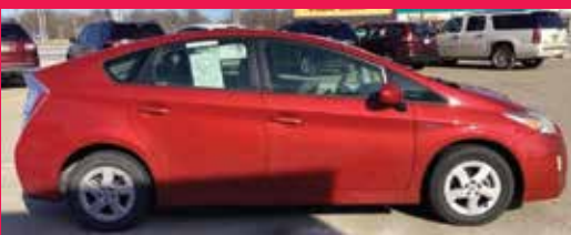
2010 TOYOTA PRIUS FWD, 4 Cyl., Red