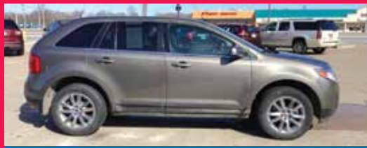
2013 FORD EDGE AWD, 6 Cyl., Gray