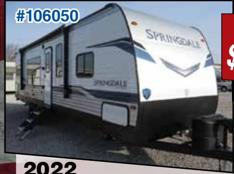
#106050 2022 Keystone Springdale 293RK