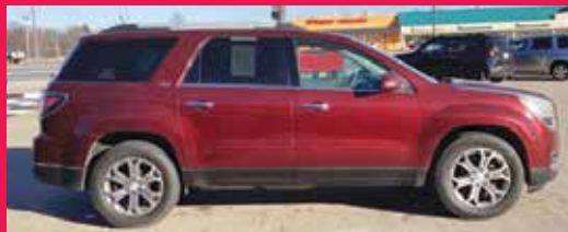
2015 GMC ACADIA AWD, 6 Cyl., Maroon