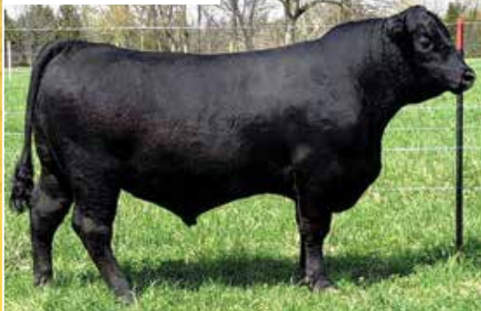
Lot 1 - 2XL Jet Black 2113

2XL Jet Black 2113 Born: 12-15-2021 Bull *20418044 #*Connealy Black Granite #Bar R Jet Black 5063 Bar R Iris Anita 0113 #*K C F Bennett Southside #*2XL Clova Pride 6230 *Blackstone Pride 3003