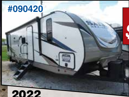
#090420 2022 Salem Hemisphere Hyper-Lyte 26BHHL