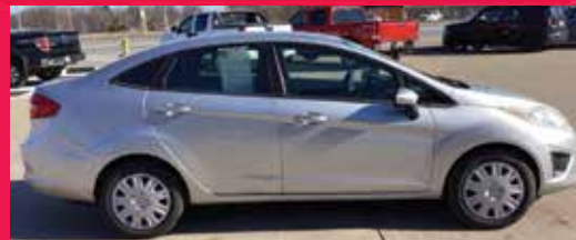
2013 FORD FIESTA FWD, 4 Cyl., Silver