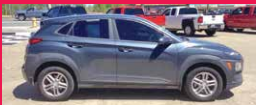
2019 HYUNDAI KONA AWD, 4 Cyl, Gray