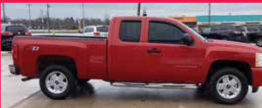
2011 CHEVY SILVERADO 1500 4WD, 8 Cyl., Red