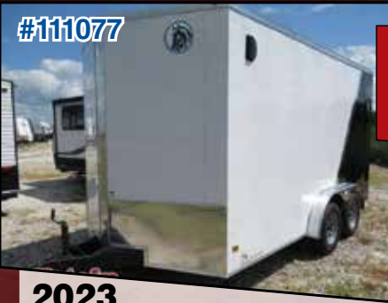
#111077 2023 Darkhorse Cargo 7.5x14 TA 7.5X14 TA

NEW, Fiberglass Exterior, Double over Double Bunks