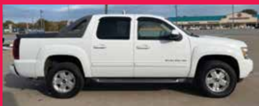
2012 CHEVY AVALANCHE 4WD, 8 Cyl., White