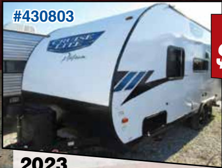
#430803 2023 Salem Cruise Lite 19DBXLX PLATINUM