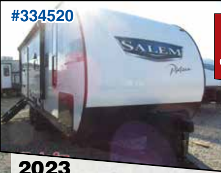
#334520 2023 Salem 22RBSX PLATINUM

NEW, Super Slide-Out, Double over Double Bunks