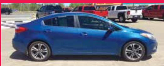
2015 KIA FORTE FWD, 4 Cyl., Blue