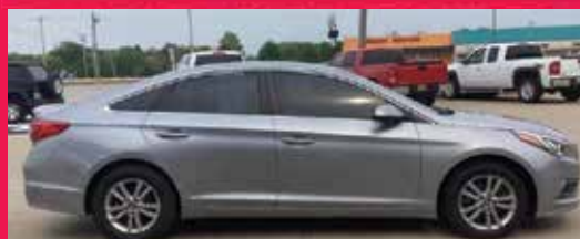
2017 HYUNDAI SONATA FWD, 4 Cyl., Gray

660-956-4849 • 2015 North Baltimore • Kirksville