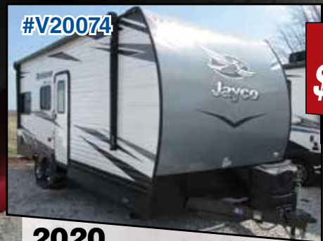
#V20074 2020 Jayco Octane Super Lite 222