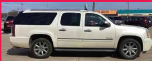
2013 GMC YUKON XL 1500 Denali, AWD, 8 Cyl., White