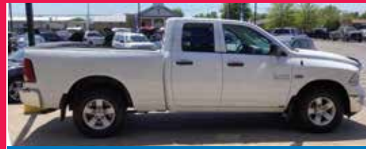
2014 RAM 1500 4WD, 8 Cyl., White