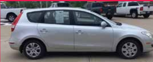
2010 HYUNDAI ELANTRA FWD, 4 Cyl., Silver