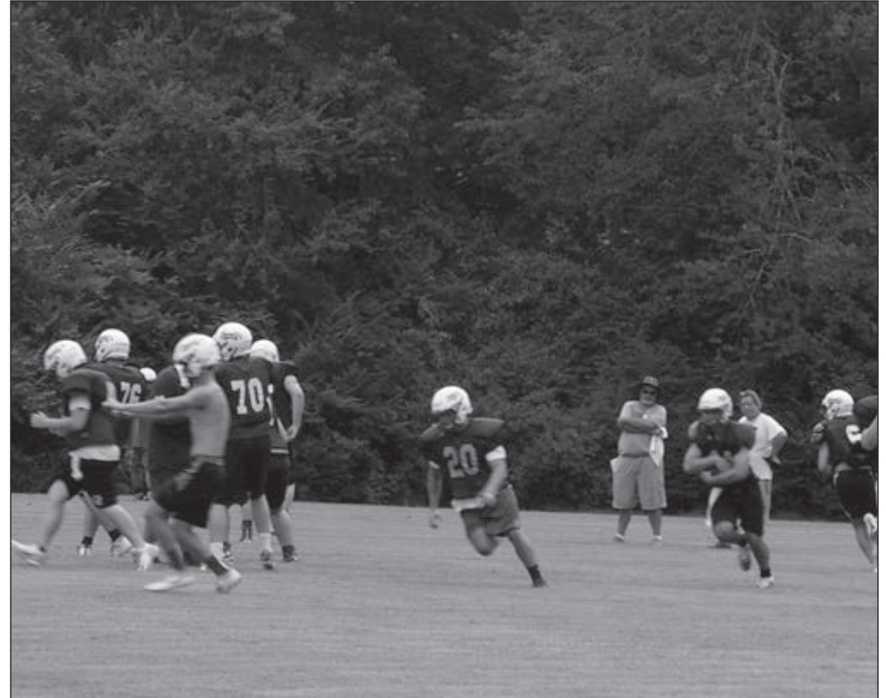
Run, Run, Run – The middle school running back running through a hole.