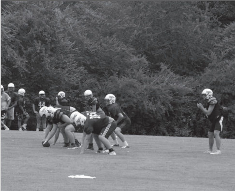
Ready, Set, Snap – Pictured is the QB awaiting the snap from the center.