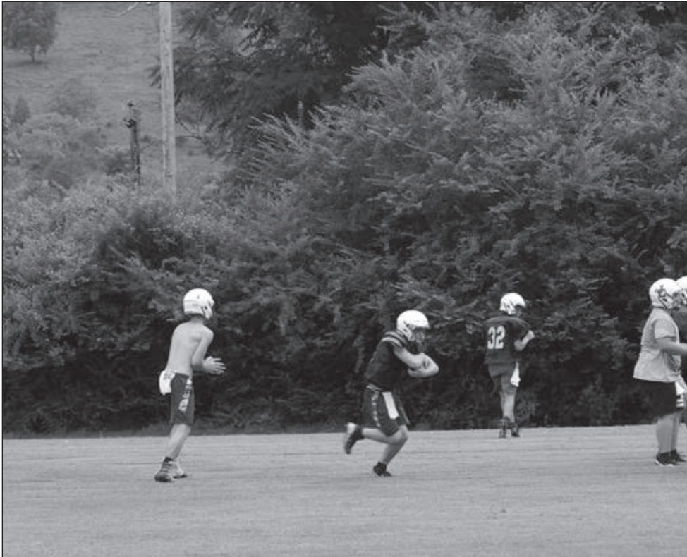
Run – Pictured is the running back with the football.