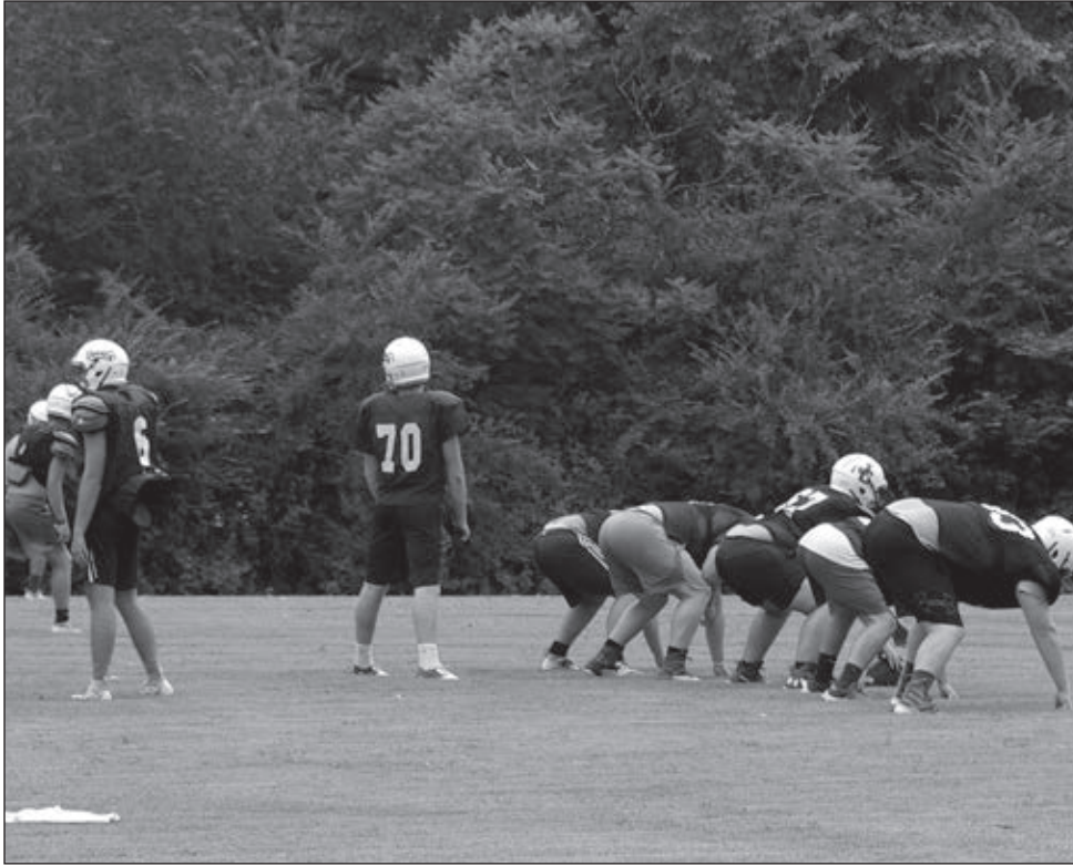
At The Line – Getting everything set to run a play during practice.