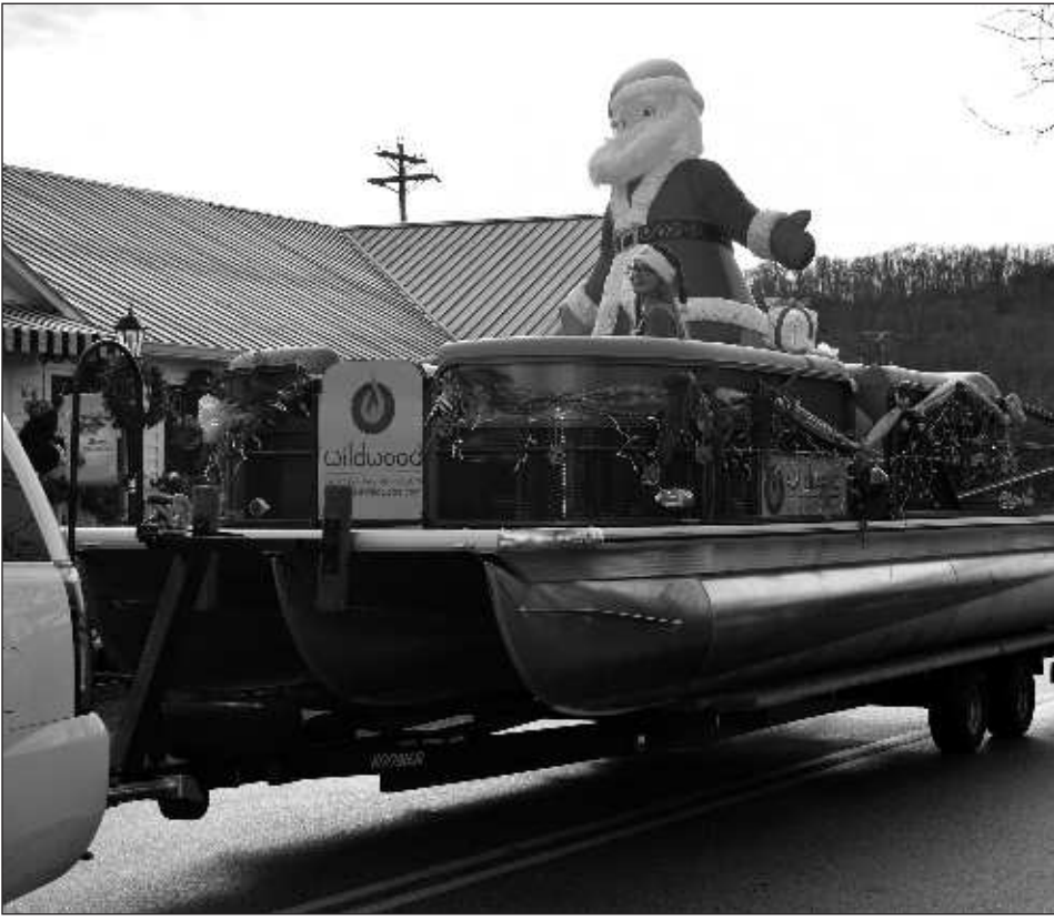
Wildwood Resort – Wildwood Resort was in this year's Granville Christmas parade trying to help get everyone in the holiday spirit by having Santa on a boat.