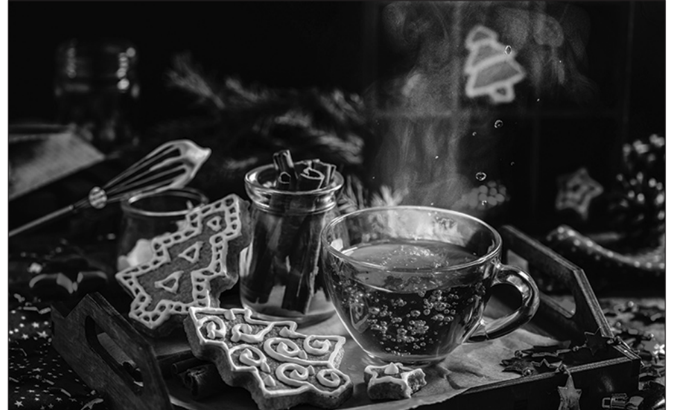
Holiday Aromas – Embrace delectable holiday scents in seasonal decor.

Rich and inviting aromas can fill a home with the holiday spirit.