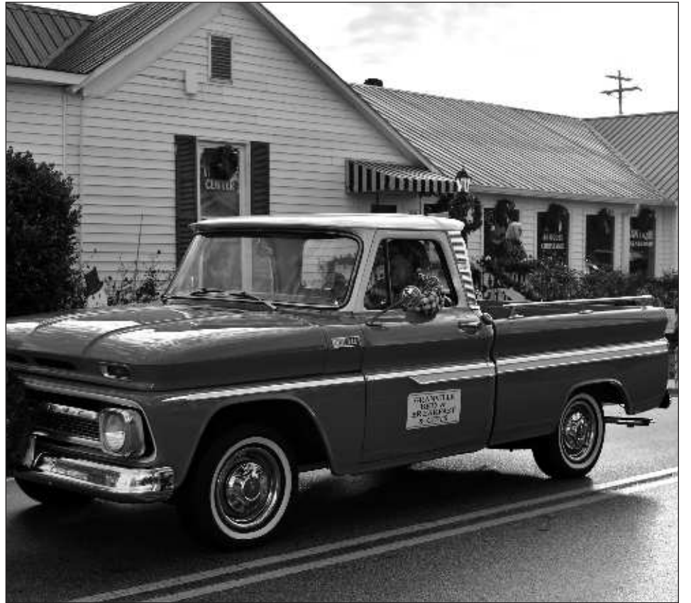
Old Truck – This antique truck was sponsored by Granville Bed and Breakfast and Gifts.