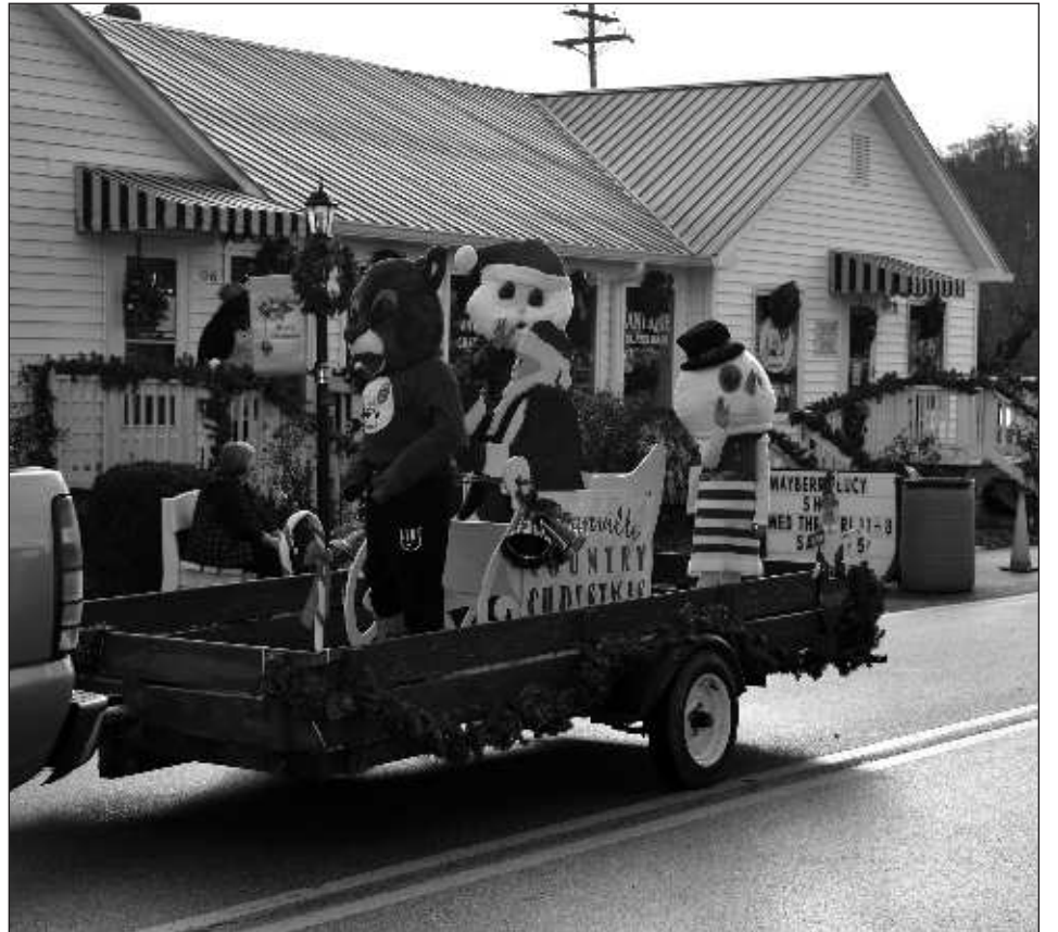
Christmas – This float was designed to get every into the Christmas spirit this season.