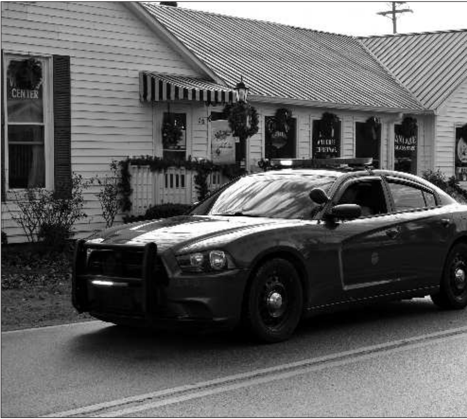
Leading – The Jackson County Sheriff's Department led the way during the Granville Christmas parade.