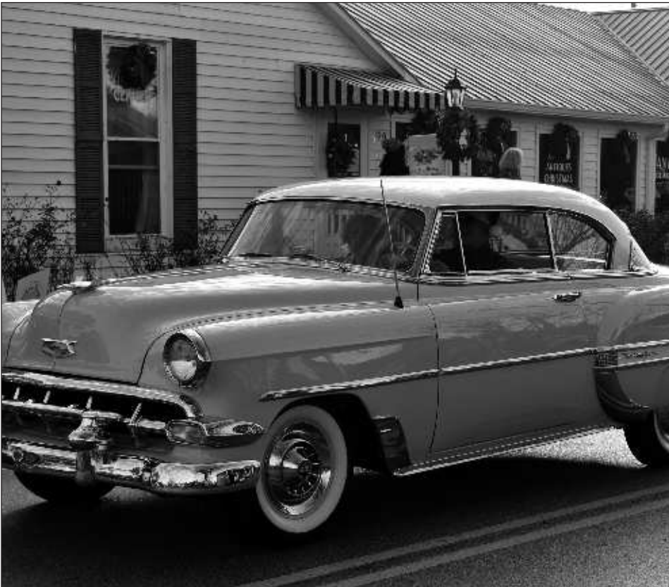
Car – There were many wonderful old cars in the Granville parade this year.