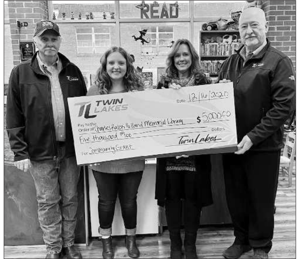
Charles Ralph Holland Memorial Library – The library was awarded $5,000 to purchase an AWE Learning Station and an AWE Early Literacy Station computer to provide the community with education resources.