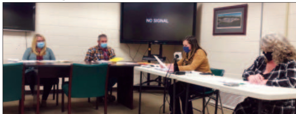
School Board – Pictured above are a few members of the Jackson County School Board conducting business at their monthly meeting on Thursday.