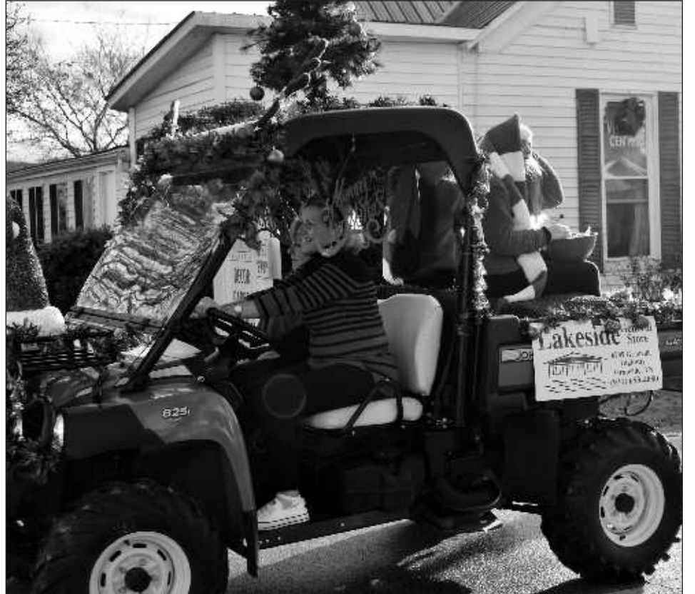
Lakeside General Store – Lakeside General Store trying to get everyone in the holiday spirit with this decked out ATV.