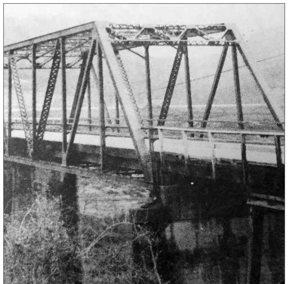
Bridge – Pictured is the old bridge that used to extend over Roaring River before it was replaced by the current bridge.