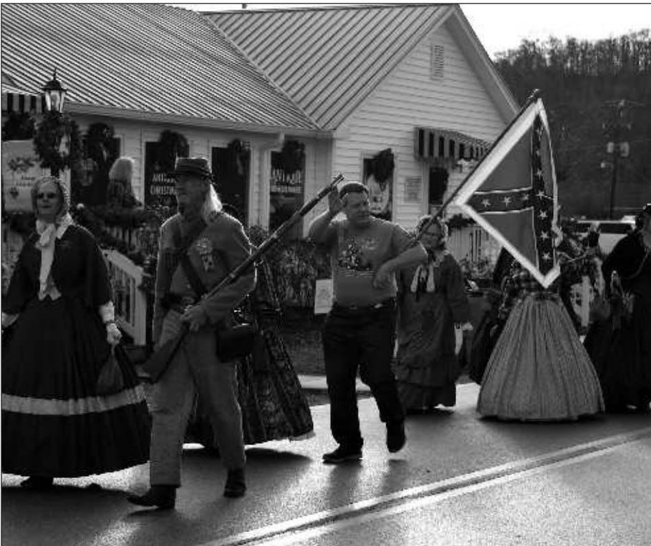
Confederacy – People walking in 1800's clothing to help people remember a different time in American history.