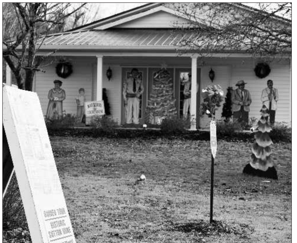
Historic Sutton Home – The Historic Sutton home all decked out and ready for Christmas.