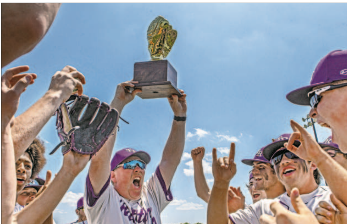
HAPPY RATTLETS: The Tolar High School baseball team celebrates its bi-district playoff win over Moody High School May 8.