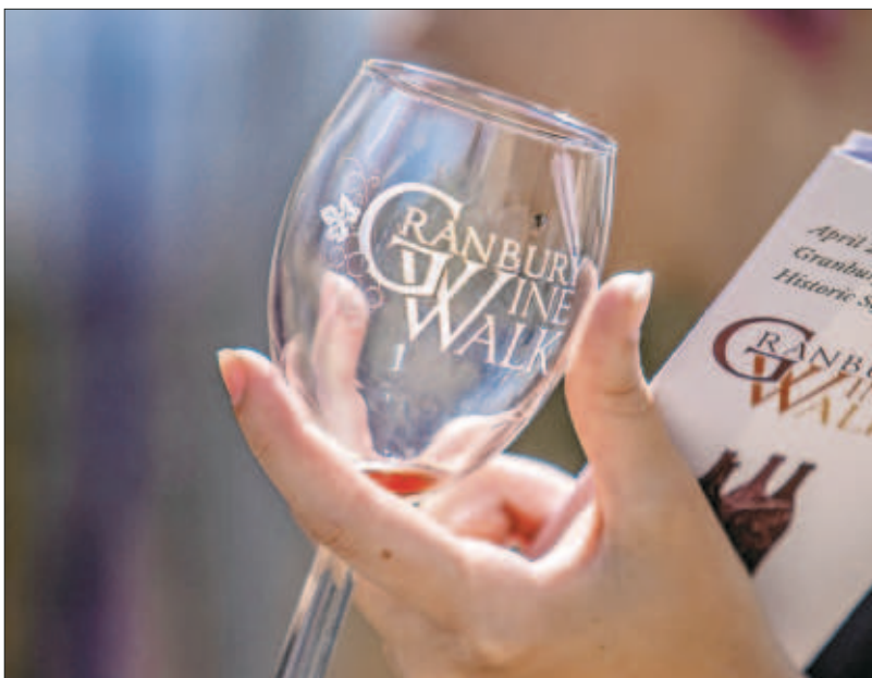
PARTY FAVORS: A guest hangs on to souvenirs from the festival.

The Riley Stephens Memorial Veterans of Foreign Wars (VFW) Post 7835 holds a luncheon to honor first responders and victims of 9/11 on the 20th anniversary of the terrorist attacks on American soil.