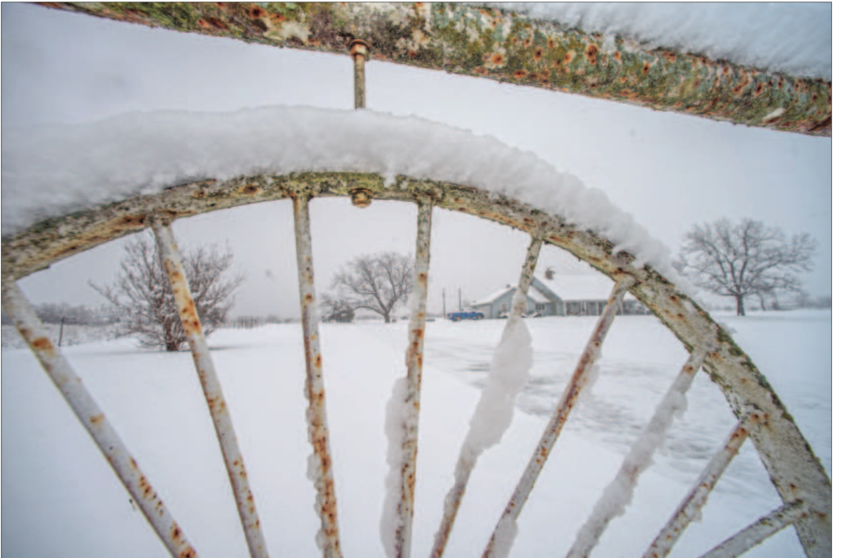
RURAL SNOWSCAPE: The dusting turned Hood County farmhouses and ranches into landscapes of ice and snow.

The Granbury City Council votes unanimously to override its fee policies at the Lake Granbury Conference Center, setting the stage for the LGCC to possibly be used by the state as a "mega site" for COVID-19 vaccine distribution.