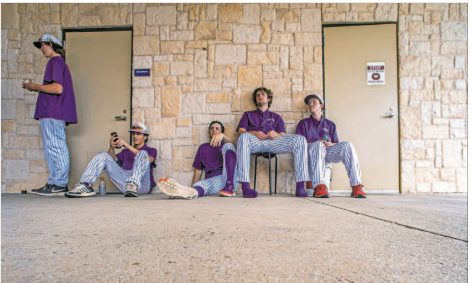
RAIN DELAY: Granbury High School Pirates wait out a rain delay at Tidwell Field May 3. A severe thunderstorm forced the cancellation of the baseball game.