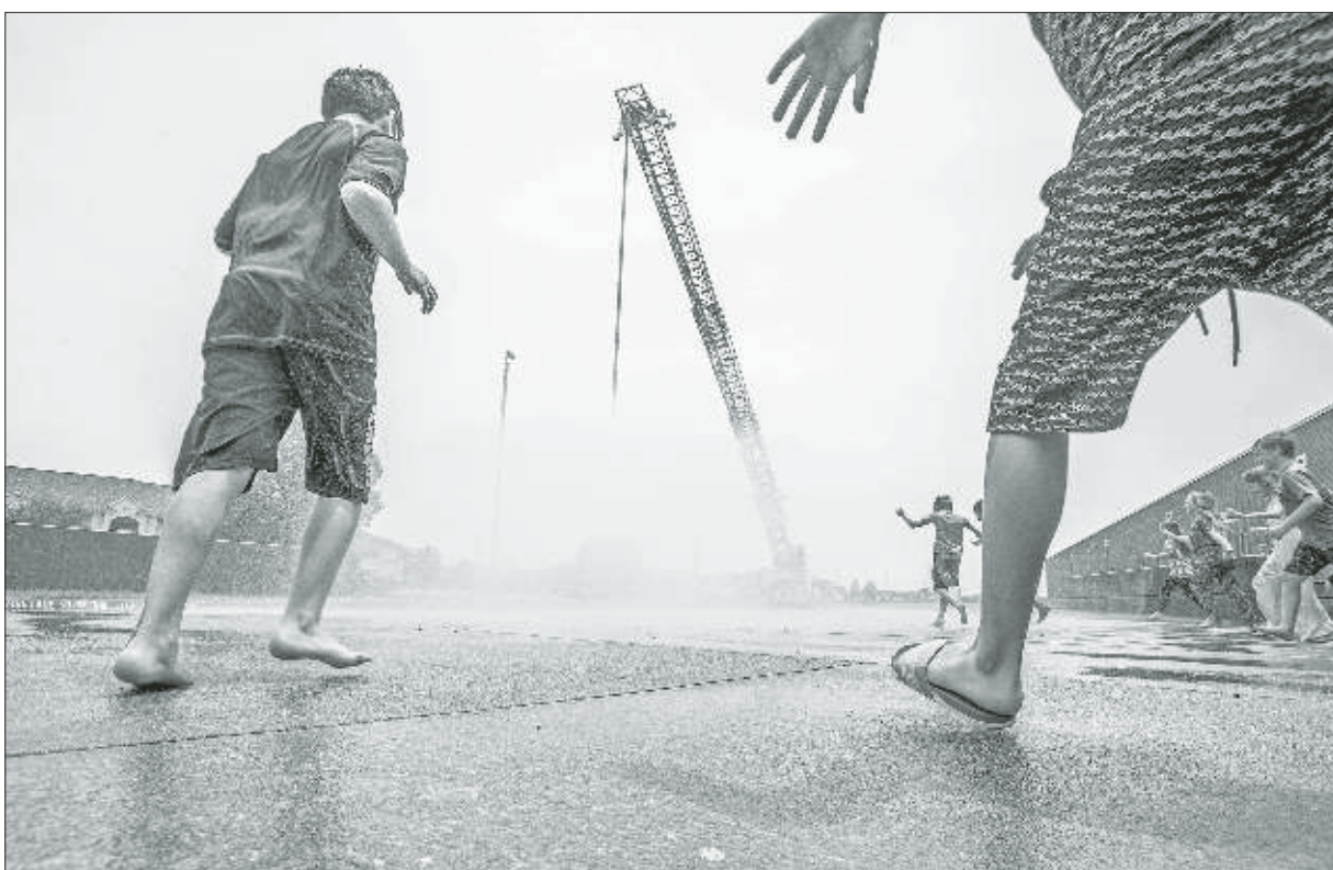
WATER WORLD: Students at John & Lyn Brawner Elementary School in Granbury, Texas went out with a splash May 20.

Granbury Church of Christ members share recipes favored by the county's first responders, who have been treated to a weekly lunch of delicious homemade dishes for the past six years.