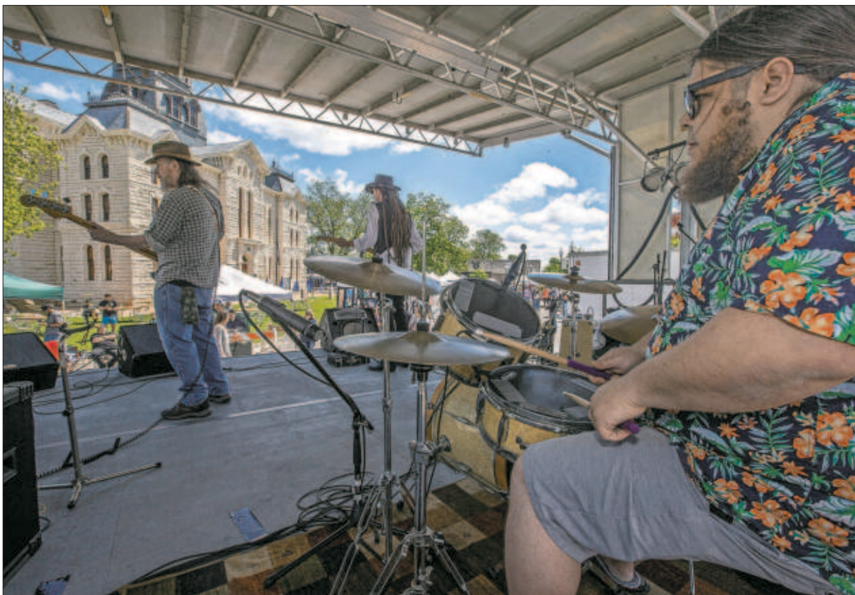
LIVE FROM THE GRANBURY SQUARE: The Granbury band The Jamigos played the main stage at the festival.