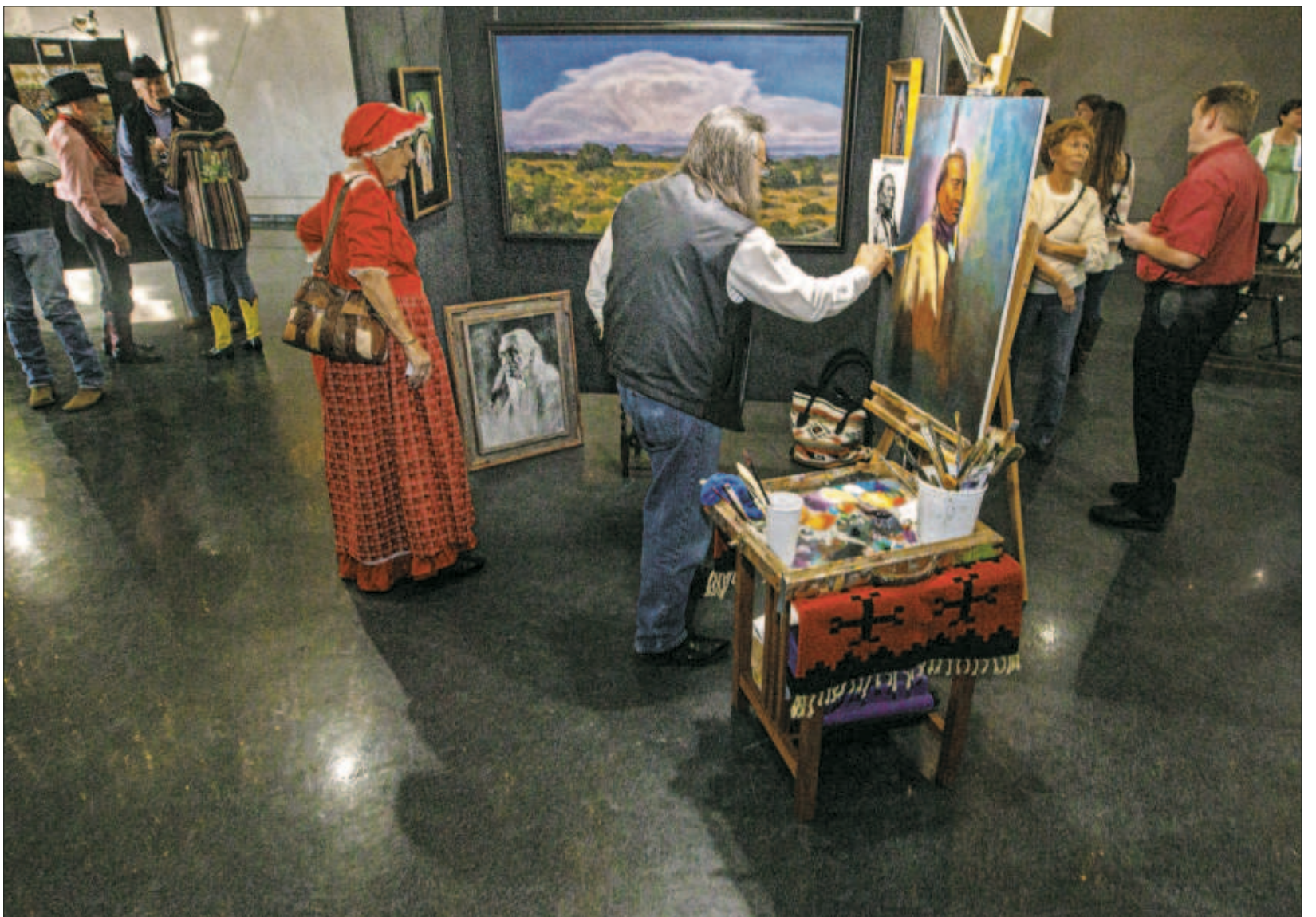
COWBOY ART: Events were held in the Langdon Center and around the Historic Granbury Square Nov. 5-7, including a Western themed art show in Celebration hall.

The Granbury City Council approves a Specific Use Permit to allow Wiley Funeral Home to renovate the adjacent building that once served as a Sears appliance store, expanding the mortuary's ability to serve the needs of families.