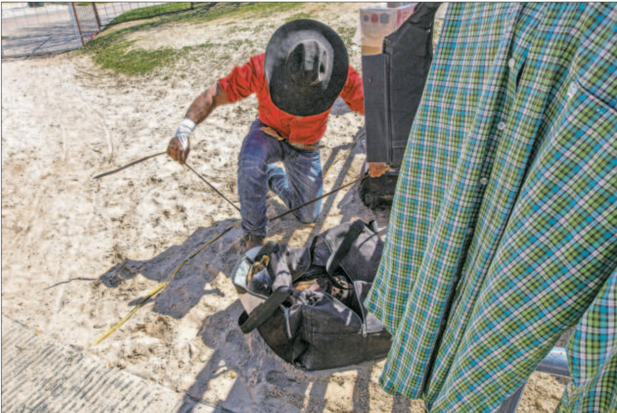
EXPERIENCED RIDER: Riders from all over the world converged on a sandy patch near Granbury's historic square.