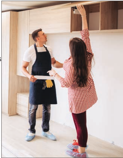
Sit down with contractors and have them spell out the minutiae of the project. A kitchen or a bathroom remodel often requires giving up spaces that are used throughout a typical day.

Some contractors may say they can fit your project into their schedules in between other jobs. While this may seem convenient and timely, your work may be put on hold if there are delays with the other job or jobs. Instead, it may be better to hold off until the contractors can devote the bulk of their