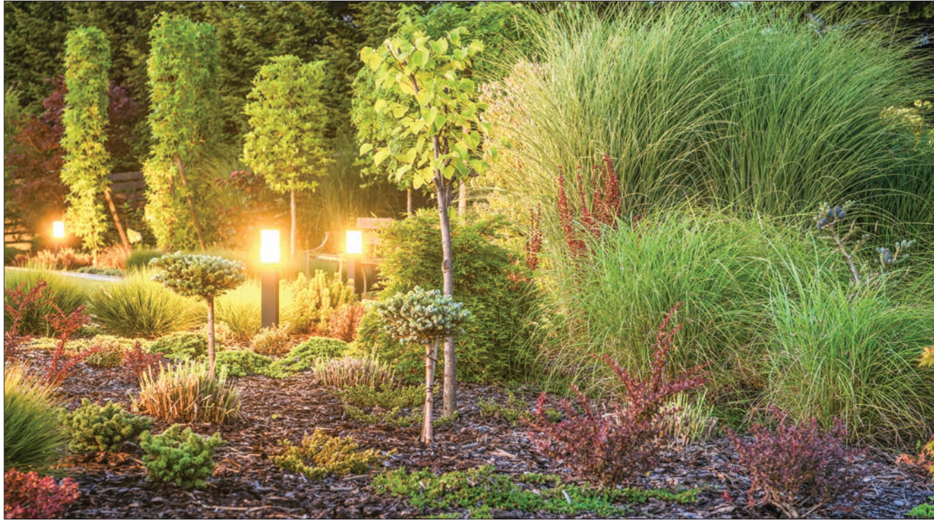
Curb appeal is often seen through the lens of how homes appear during daylight hours, but landscape lighting can make homes look better and more modern, and potentially safer, after the sun goes down.

When considering landscape lighting, homeowners should know that there are various options to consider. According to the lighting experts at Lumens, spotlights project a concentrated and narrow beam of light that's usually around 45 degrees. Spotlights are often chosen to highlight specific features on a property, like a component of the landscaping. Individuals who want to cast light over wider, more general areas may consider floodlights, which Lumens