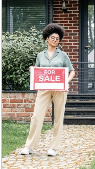
Make sure that buyers see your home in a positive light from the first moment they pull up for a walk-through.

A few simple strategies can help sellers get more money for their homes.