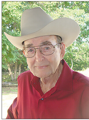
In lieu of flowers please donate to the Oglesby Lions Club or the Veterans charity of your choice.