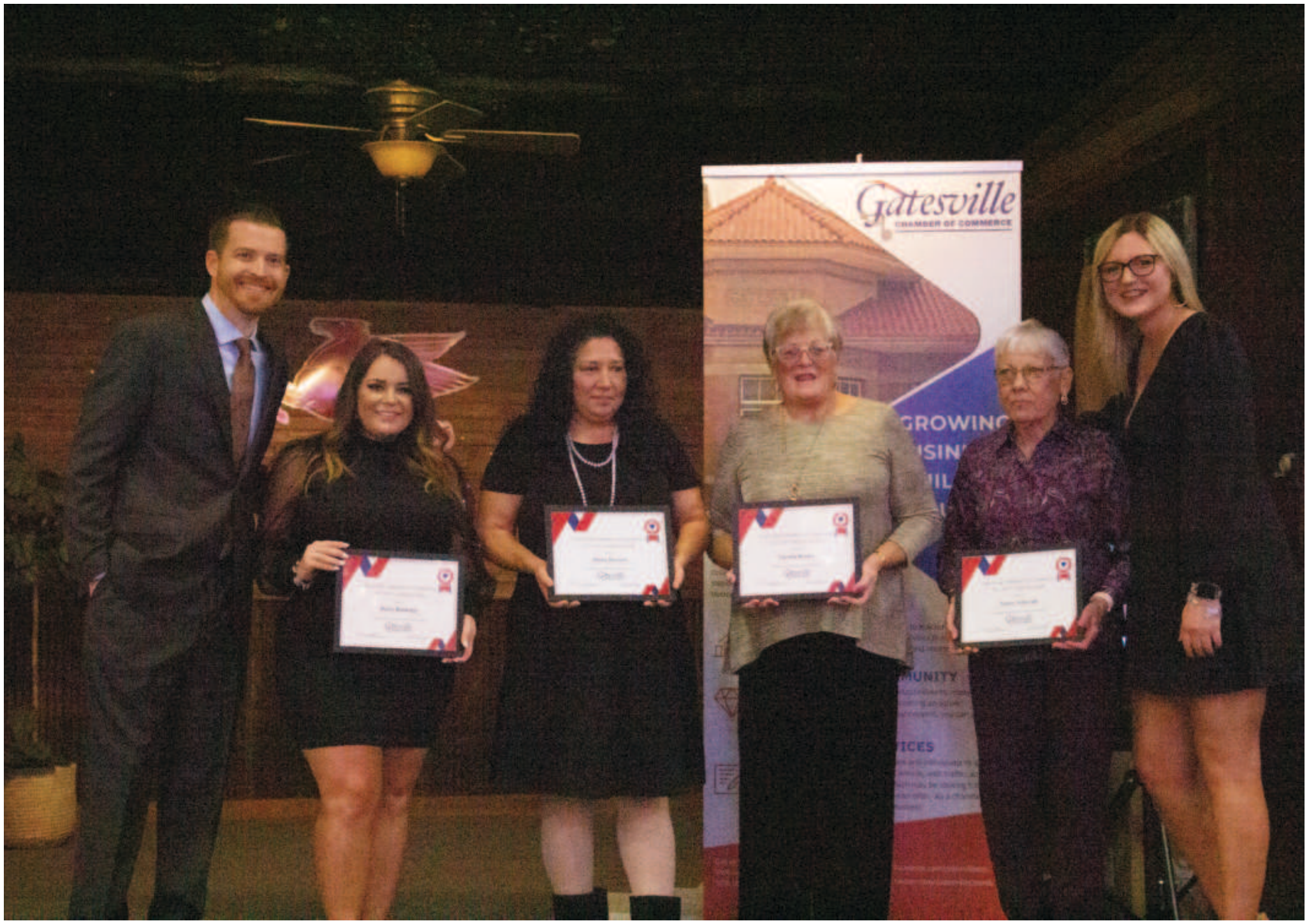
TRISTON MCGEHEE | THE GATESVILLE MESSENGER