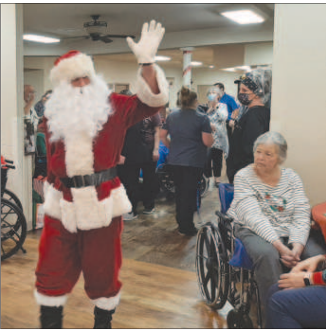
Residents and their families recently celebrated Christmas at Hillside Medical Lodge.