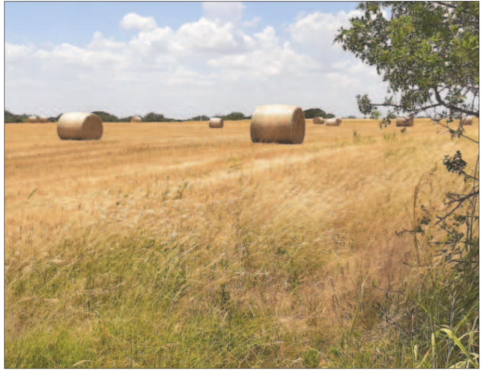
DAVID SCOTT | THE GATESVILLE MESSENGER

For additional information about LFP, including eligible livestock and fire criteria, contact your Coryell County USDA Service Center at 254-865-7012, option 2 or visit fsa.usda.gov .