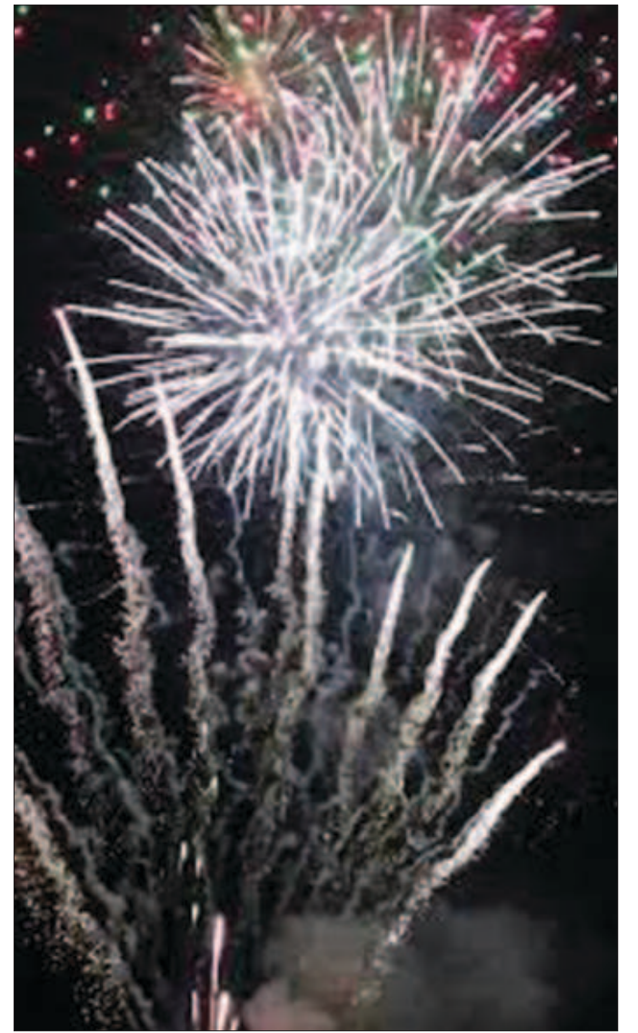
STAFF PHOTO A shot of the grand finale of last year's City of Gatesville fireworks show.

To culminate the day, The City of Gatesville will present a fireworks show at dark around 9:30 p.m. The fireworks will be set off in the vicinity of Gatesville ISD and will be visible from multiple parking areas. Seating will also be available in McKamie Stadium bleachers, but access to the field will not be allowed. The fireworks display is presented by the City of Gatesville and sponsored by H-E-B.