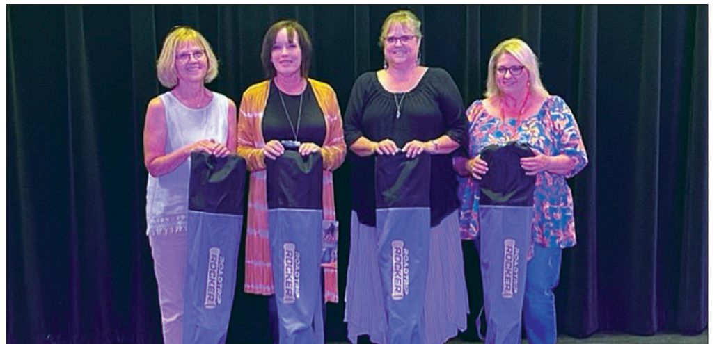
30 YEARS SERVICE: GISD employees honored for 30 years with the district.