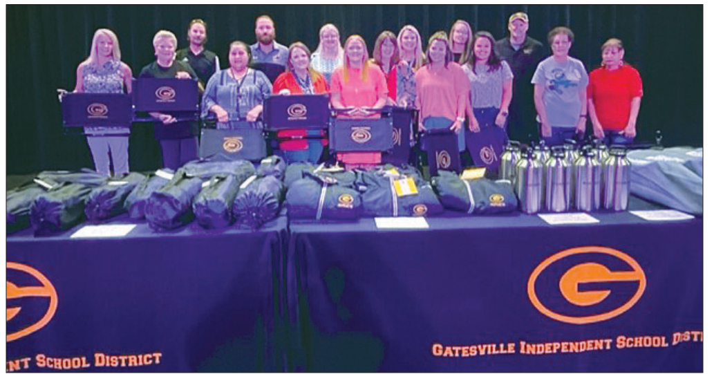
10 YEARS SERVICE: GISD employees honored for 10 years with the district.