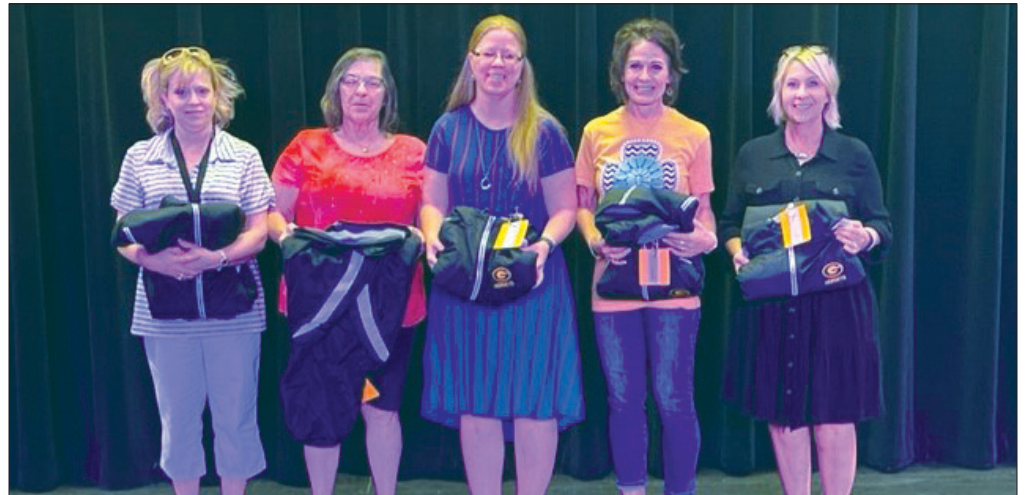
20 YEARS SERVICE: GISD employees honored for 20 years with the district.