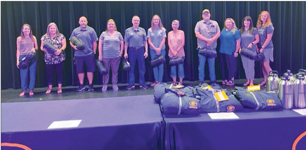
15 YEARS SERVICE: GISD employees honored for 15 years with the district.