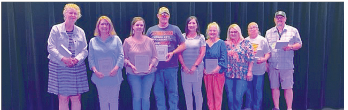
GISD RETIREES: Employees retiring from GISD.