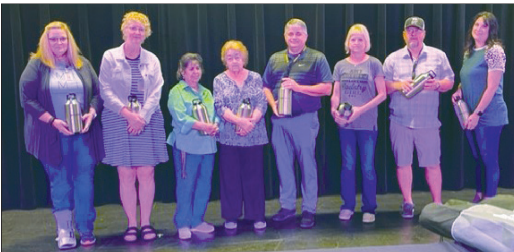
25 YEARS SERVICE: GISD employees honored for 25 years with the district.