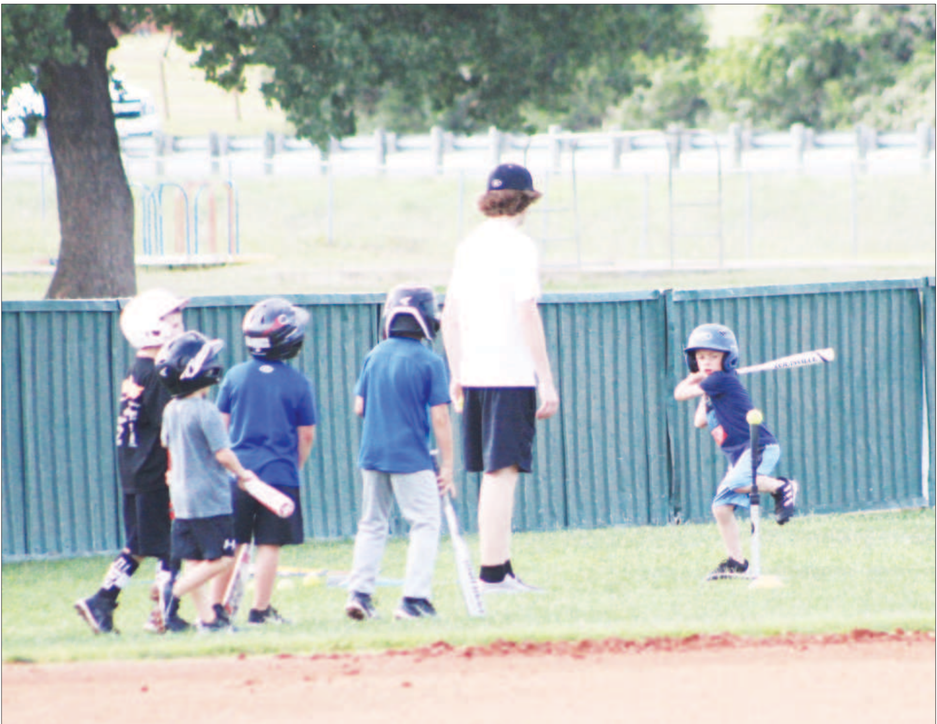
SWINGTIME: Gatesville High School baseball players worked with younger students on a variety of baseball skills during camp May 31 through June 2.