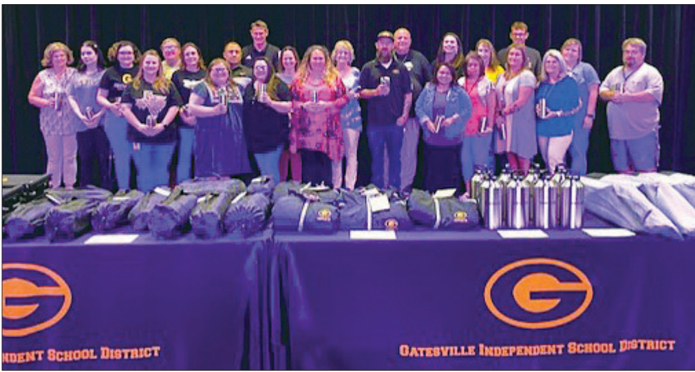
FIVE YEARS SERVICE: GISD employees honored for five years with the district.