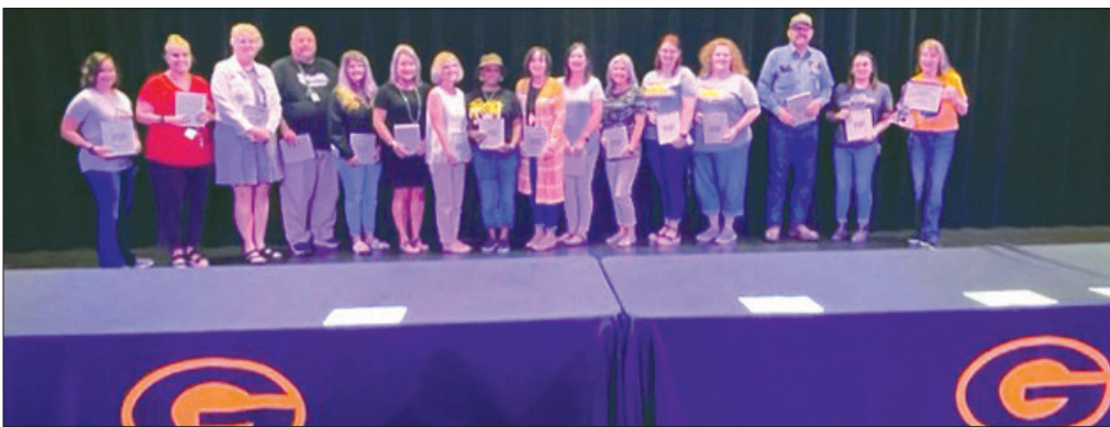
EMPLOYEES OF YEAR: GISD teachers and employees of the year for 2021-2022.