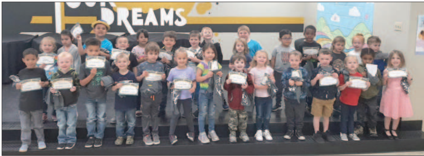
Gatesville Primary Pre-K award recipients