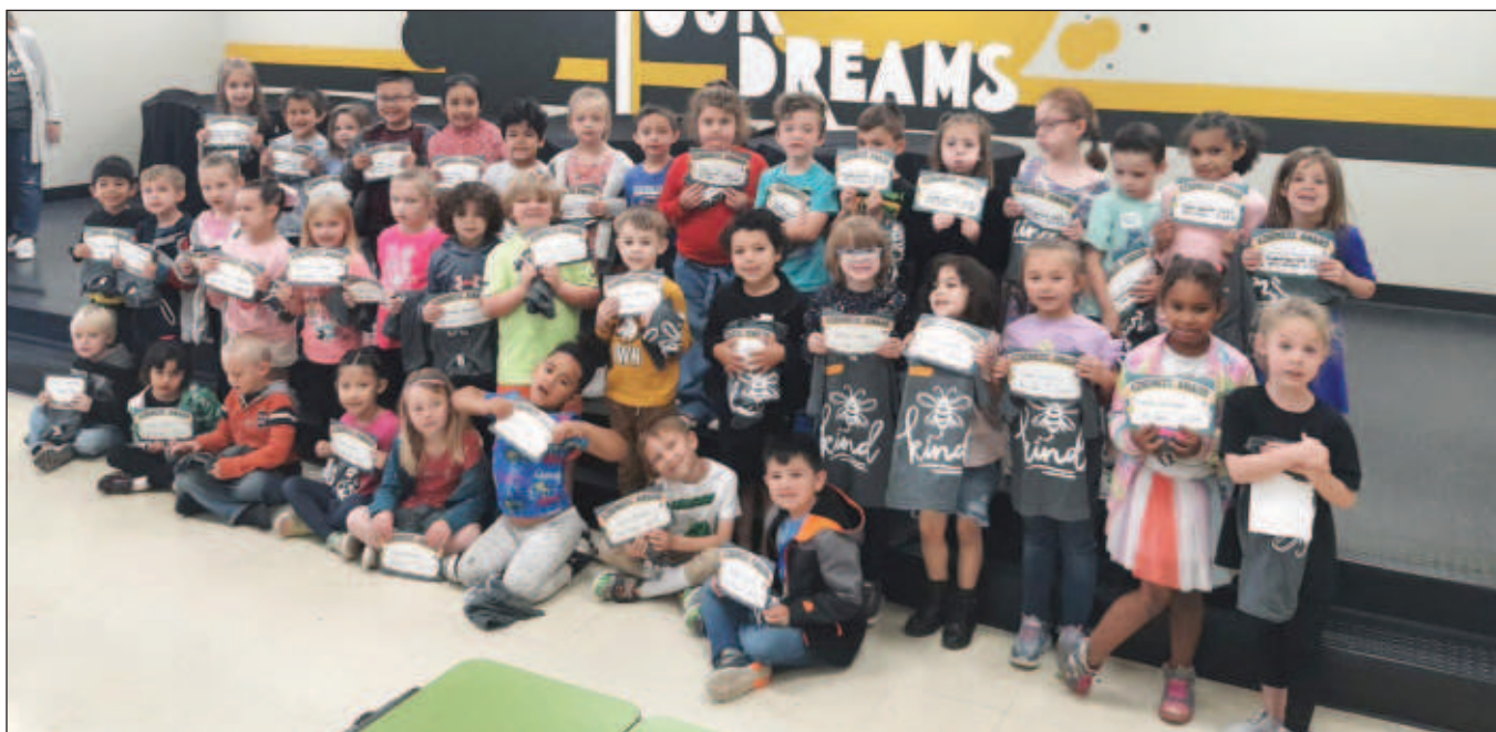
Gatesville Primary Kindergarten award recipients