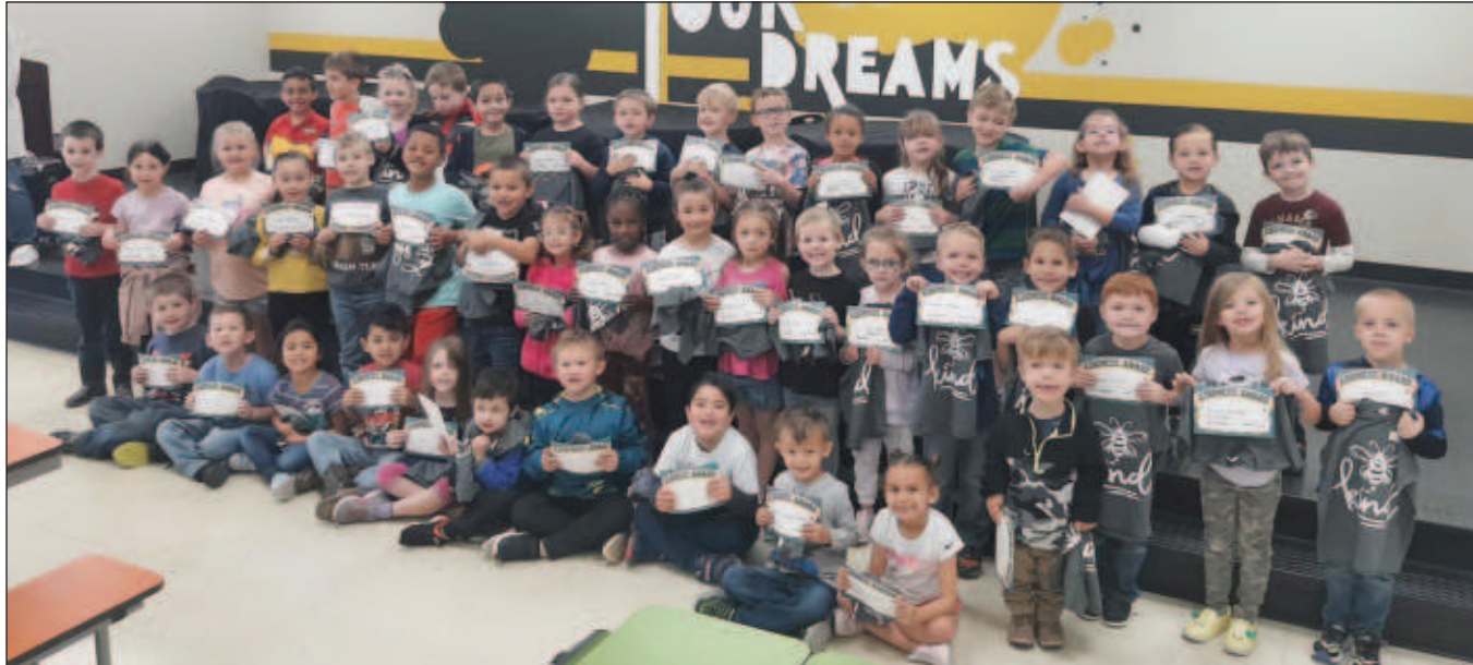
Gatesville Primary Kindergarten award recipients