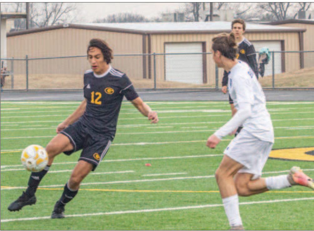
TRISTON MCGEEHEE | THE GATESVILLE MESSANGER