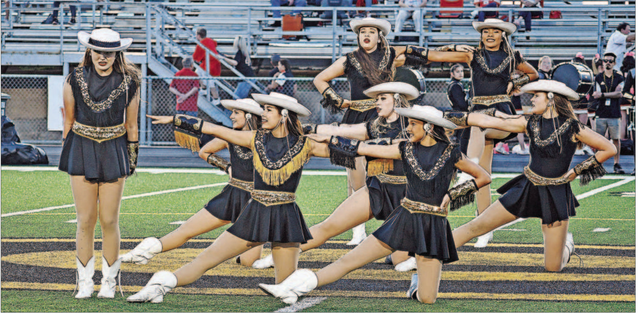
HALFTIME ROUTINE: The Gatesville High School Dazzlers dazzled the crowd before the Hornets took to the gridiron Friday.