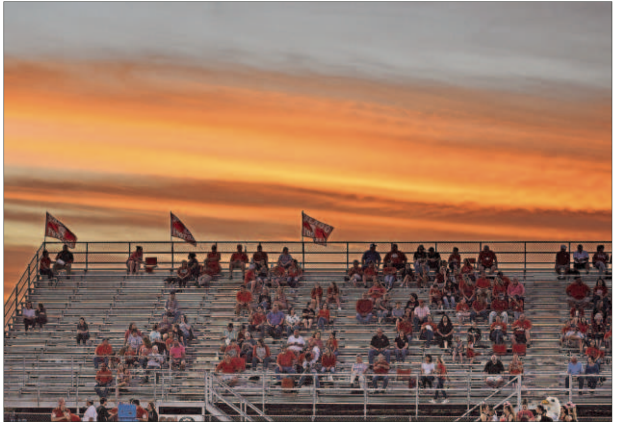
CENTRAL TEXAS SUNSET: The day's dying light paints the sky all shades of orange.