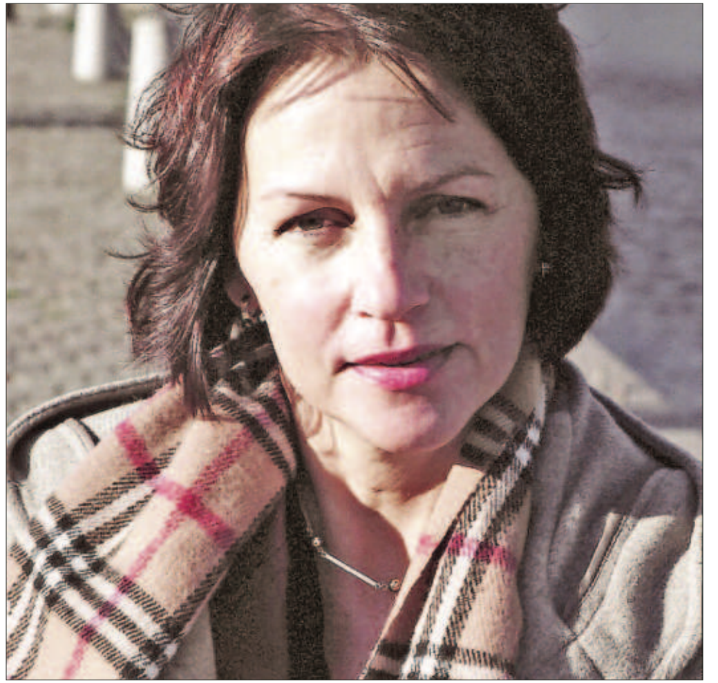
"AN ELDERLY LADY MUST NOT BE CROSSED": Author Helene Tursten.

You don't have to have the first Tursten novel to enjoy this one, but you'll want it when you're finished. If you're looking for something sharply sinister, "An Elderly Lady Must Not Be Crossed" must be remembered.