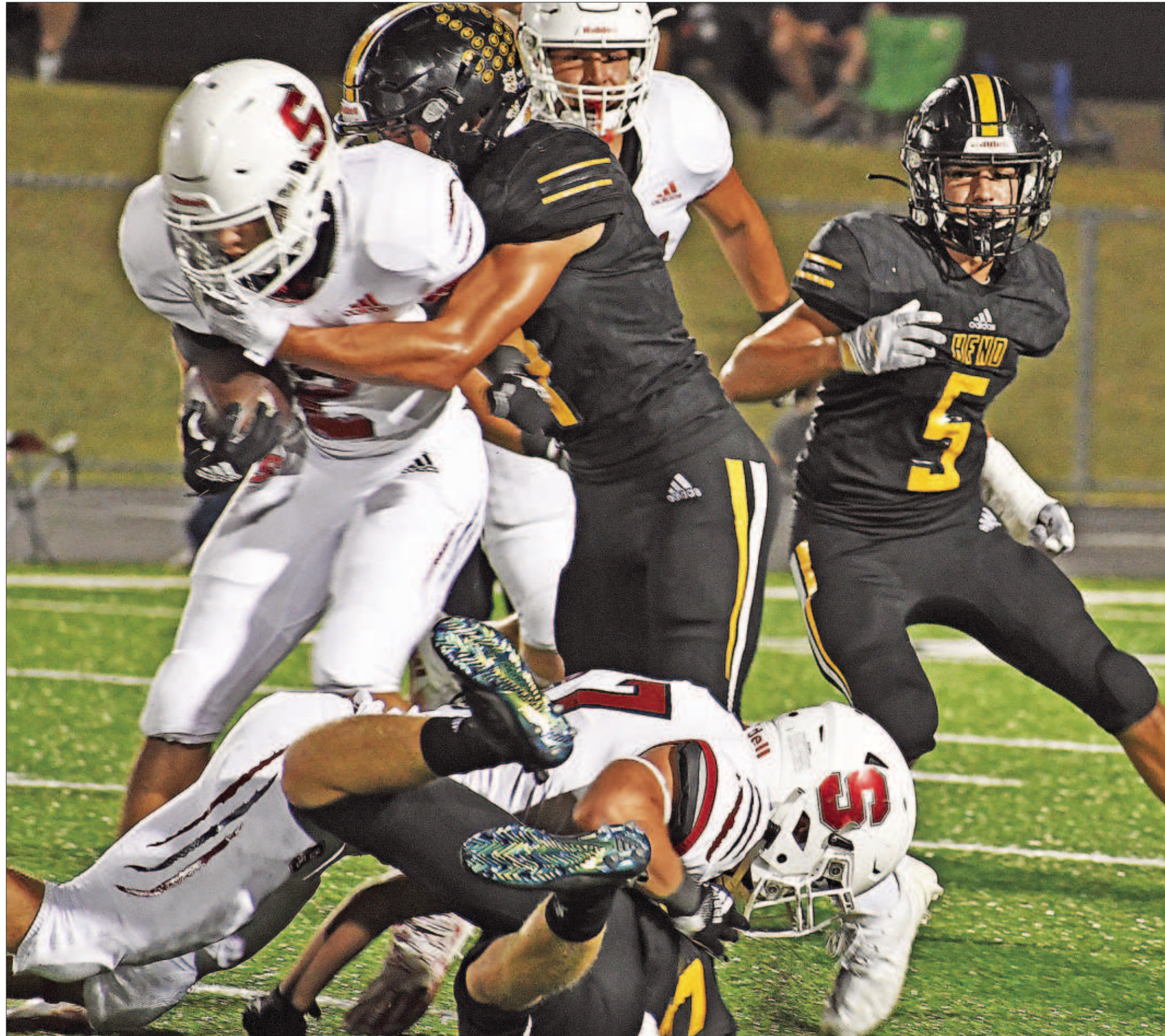
PLUGGIN THE HOLES: The defense fills the gaps against Salado's slot-T formation.