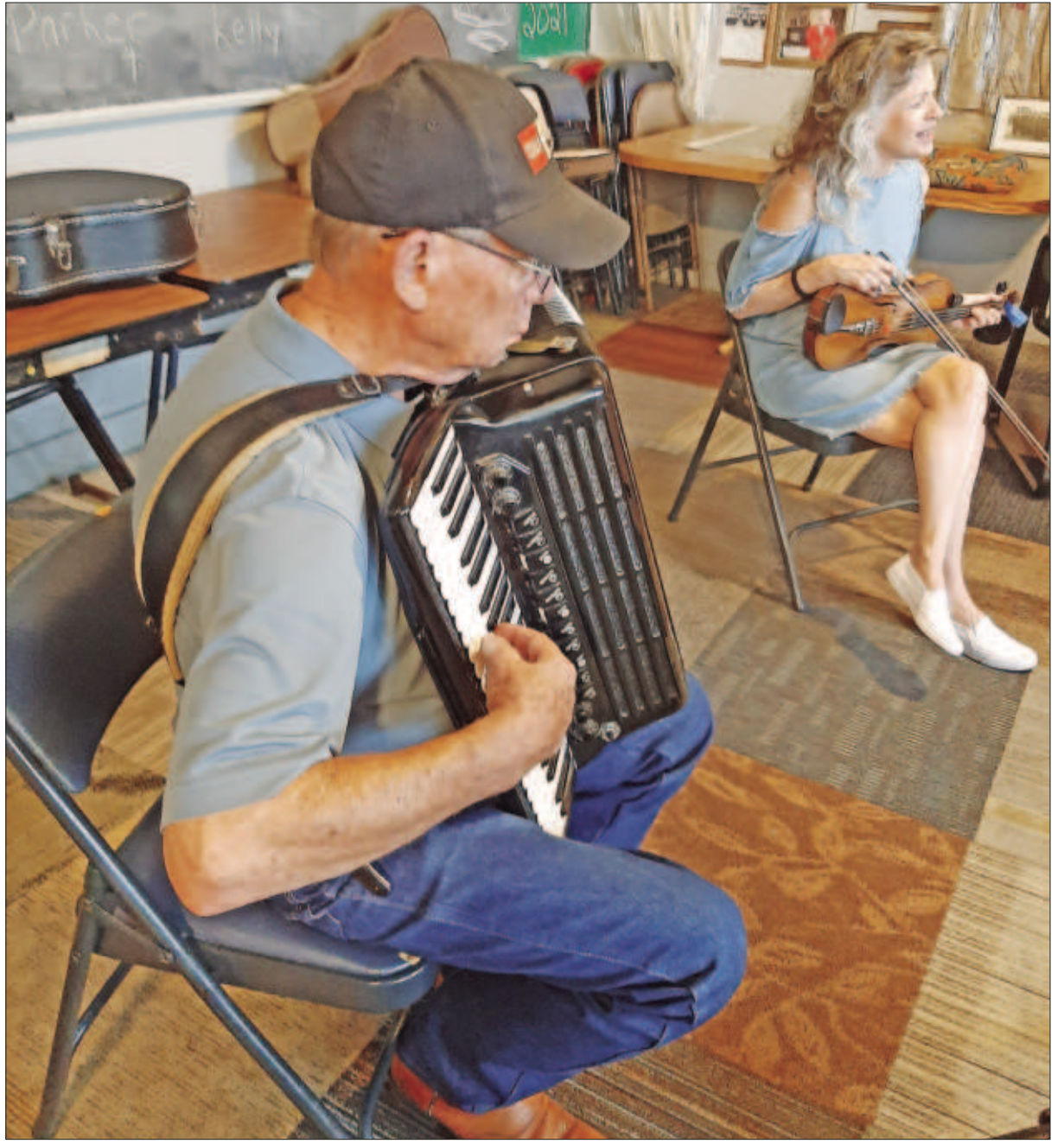
DAVID SCOTT | THE GATESVILLE MESSENGER

The Pearl Cemetery Association is still accepting donations to build a pavilion to protect attendees from the often-harsh weather conditions during interments and services. You may send a donation or a donation in memory of a loved one to Pearl Cemetery Association, C/O