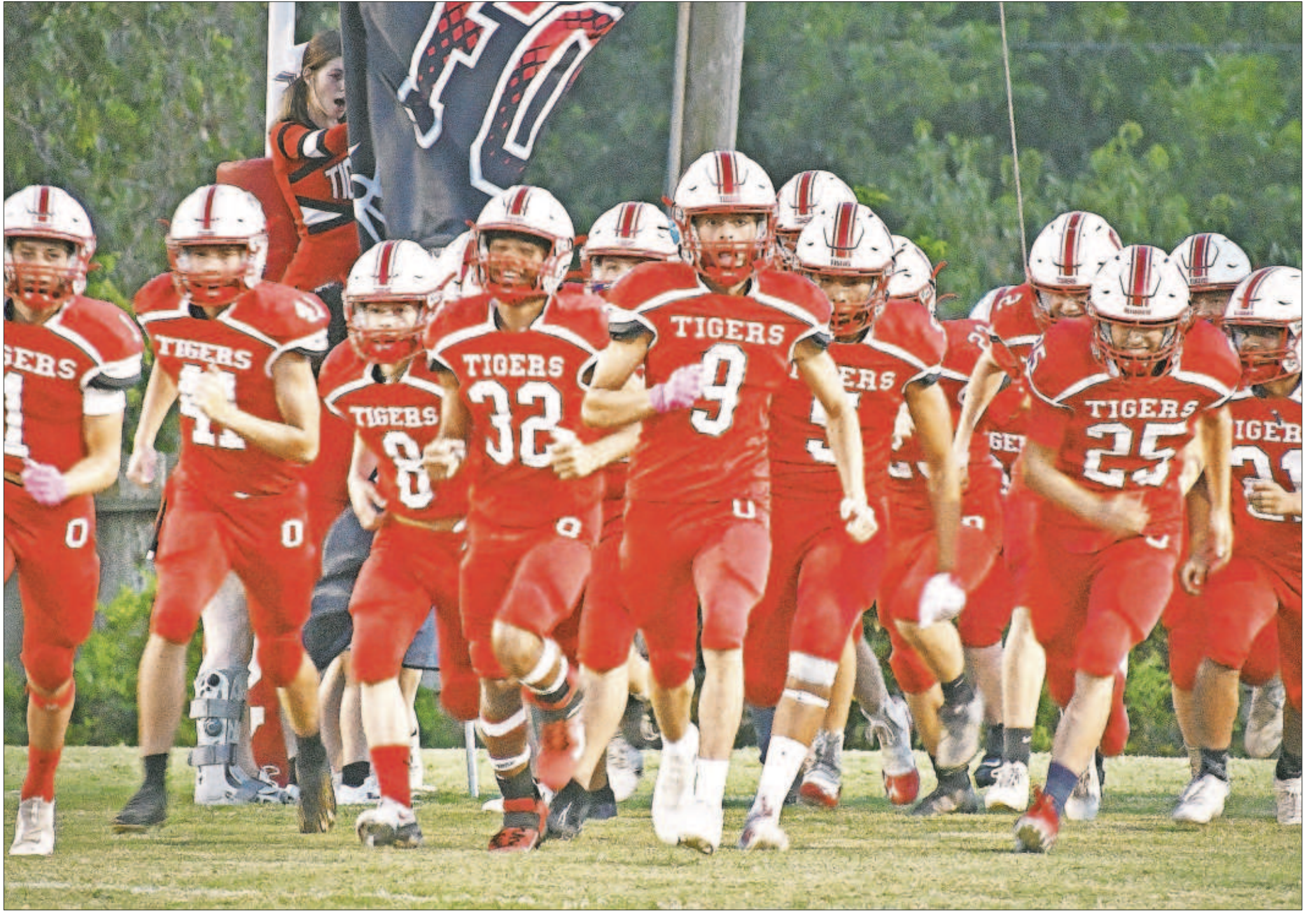
TIGERS EN MASSE: The Oglesby football team charges onto the field Thursday night for the Tigers' non-district game with Waco Live Oak.