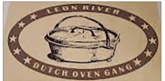
SIGN OF AUTUMN: The Leon River Dutch Oven Gang logo.

hand as well. Children's activities including crafts will take place along with guided hikes and scavenger hunts. For more information, please call the park at 254-853-2389