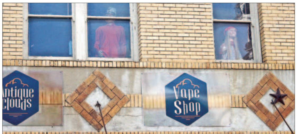
BACK STORY: Two other mannequins downtown are local siblings with an interesting tale to tell.

Shortly after the cowboy began living in the square, two new mannequins moved in on the 7th Street side of a building downtown.