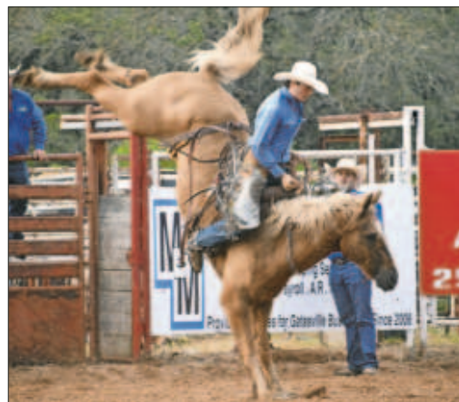
Find more photos from the 84th annual Gatesville Riding Club Rodeo inside. PAGE 10