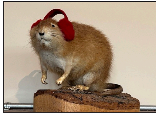
Keep those muskrats warm this winter -- make sure you're properly dressed for the winter conditions.