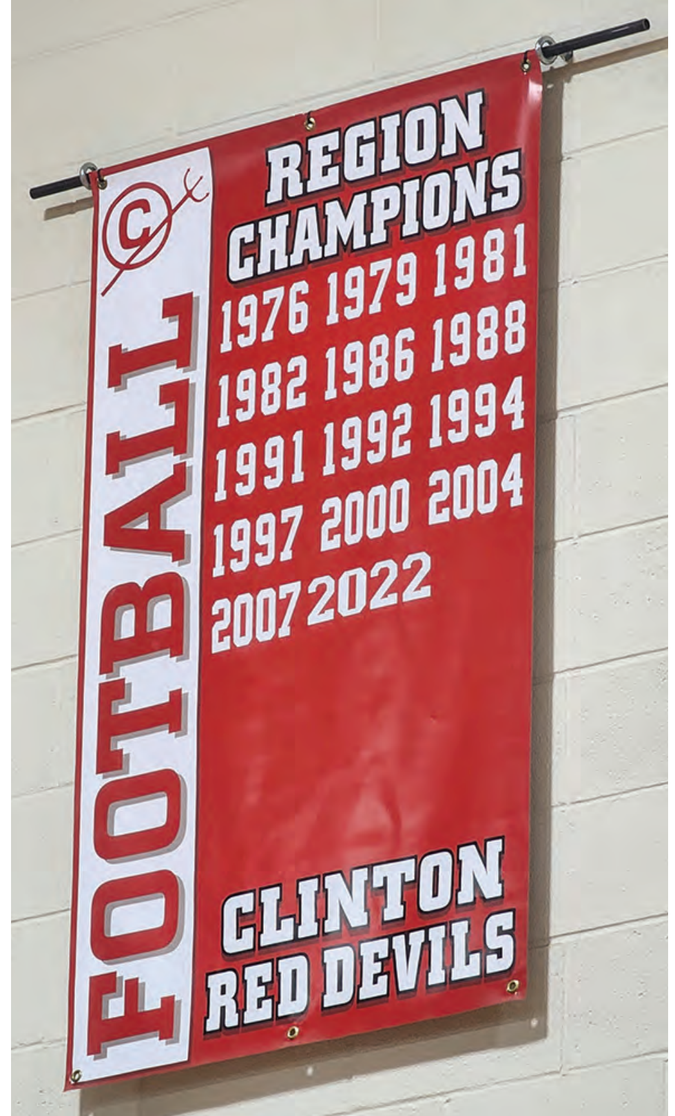
Banner in the main gym