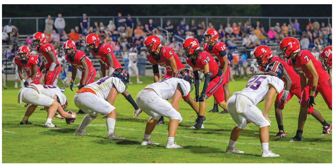
Devils\ of\ Doom\ -\ The\ Clinton\ Red\ Devils\ on\ defense\ against\ Chapman, Sept.\ 15,2023.