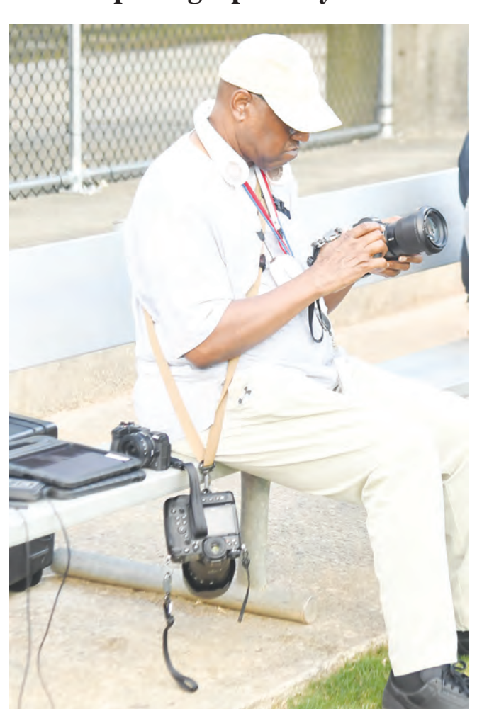
FLETCHER PRUITT JR. - FOR THE BEST IN CLINTON HIGH SCHOOL ACTION PHOTOGRAPHY, VISIT HTTPS://www.fpruitt.com/ACTION