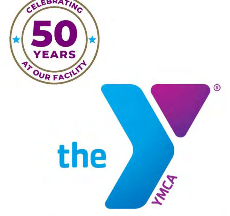
We are excited to celebrate 50 years at our facility! Come Join us for the ribbon cutting of the newly Renovated pool and Tennis/Pickle ball courts!