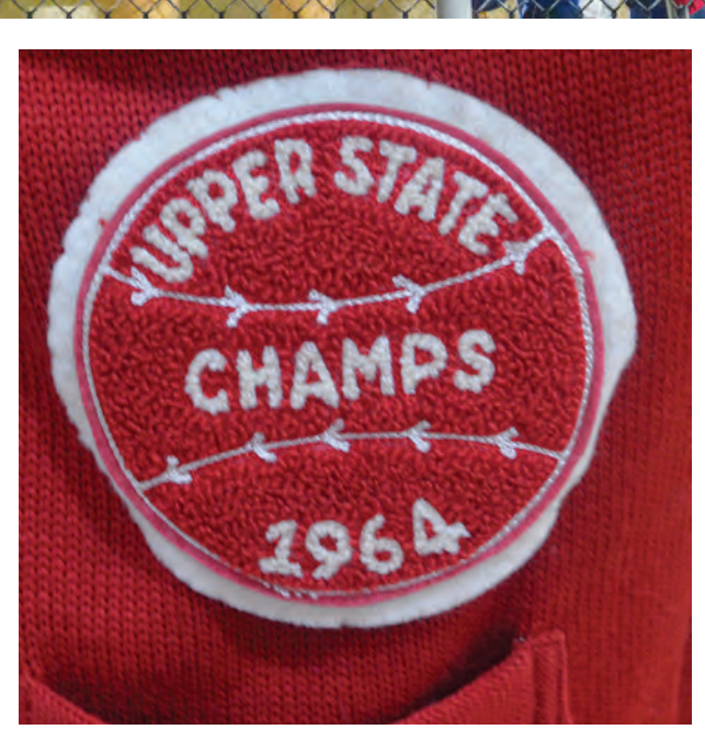
Plenty of other sports are represented at the Sept. 15 celebration at "the old" Clinton High School.