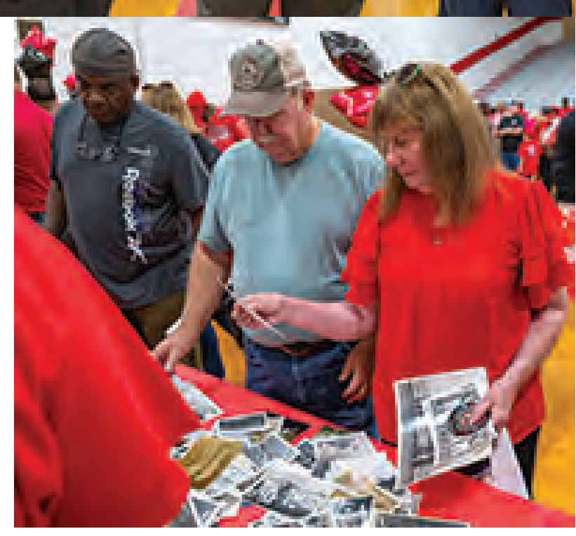
The 100th Anniversary of Clinton High School Football Game, Sept. 22, versus Chapman, photographed by ...