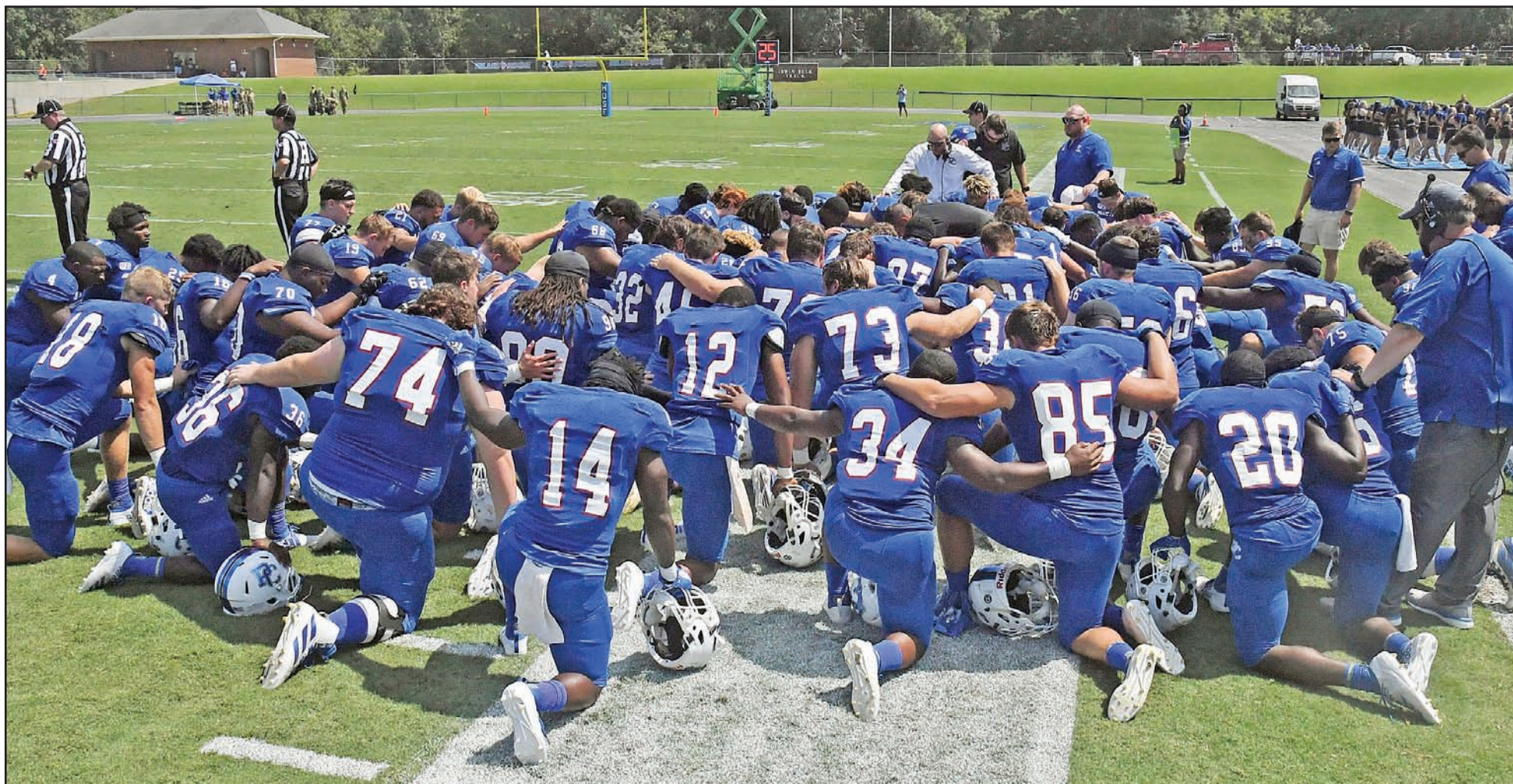
PC Football: A team that prays together, stays together. PC's 2020 football season was canceled due to the COVID-19 pandemic.