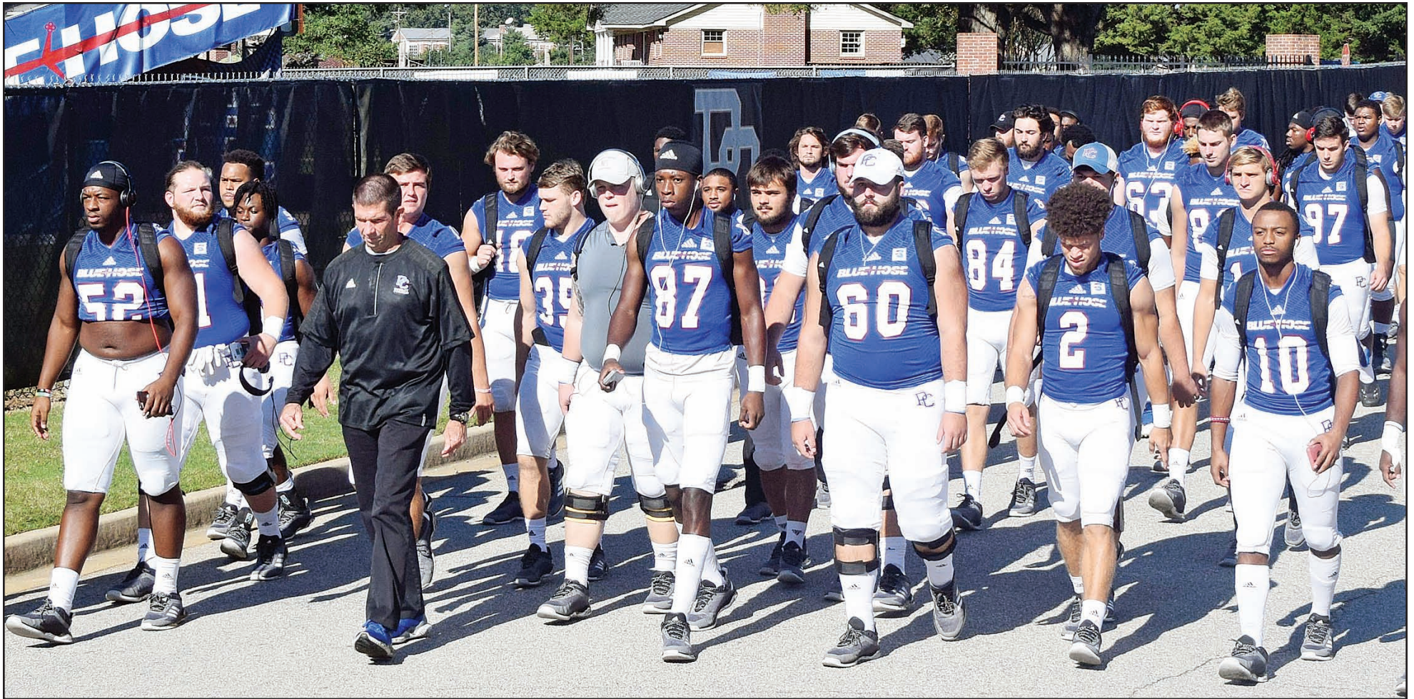
Ready to rumble. The Blue Hose are ready for action. PC's 2020 football season was canceled due to the COVID-19 pandemic.