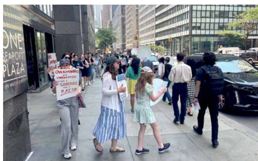
Legal Aid Society attorneys walked a practice picket line earlier this year. Attorneys at the organization ratified a three-year contract agreement last week in a 59-41 percent vote.

"Now more than ever, New York relies on our legal services workers to meet an affordability crisis and attacks on due process," the elected officials wrote to CAMBA management. "We urge the leadership of CAMBA, Inc. and CLS to stay at the table and do whatever is necessary to ensure that members of [CAMBA Legal Services Workers United] can return to work with a fair and just contract. New Yorkers need them back on the front lines."