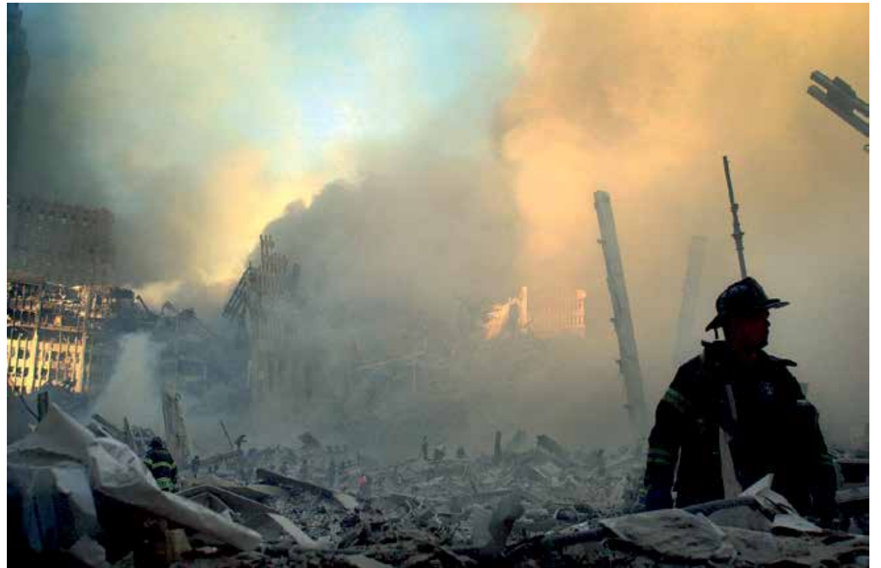
A firefighter moves through piles of debris at the site of the World Trade Center, Tuesday, Sept. 11, 2001.