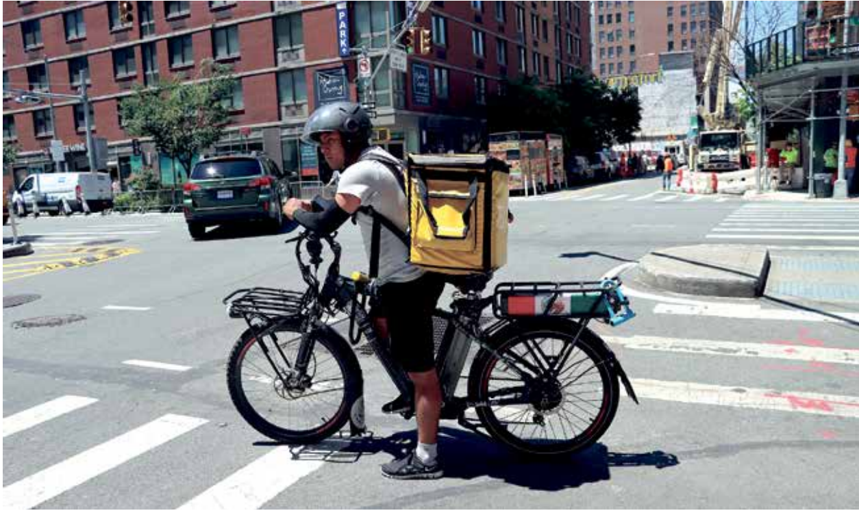
To address potential safety issues raised by app-based delivery workers traveling at high speed or in an unsafe manner so they can meet tight delivery deadlines, Mayor Eric Adams has proposed a rule that would bring additional oversight to app-based delivery companies.

Among the proposed reforms, third-party delivery app companies would be required to provide a bicycle safety course developed by