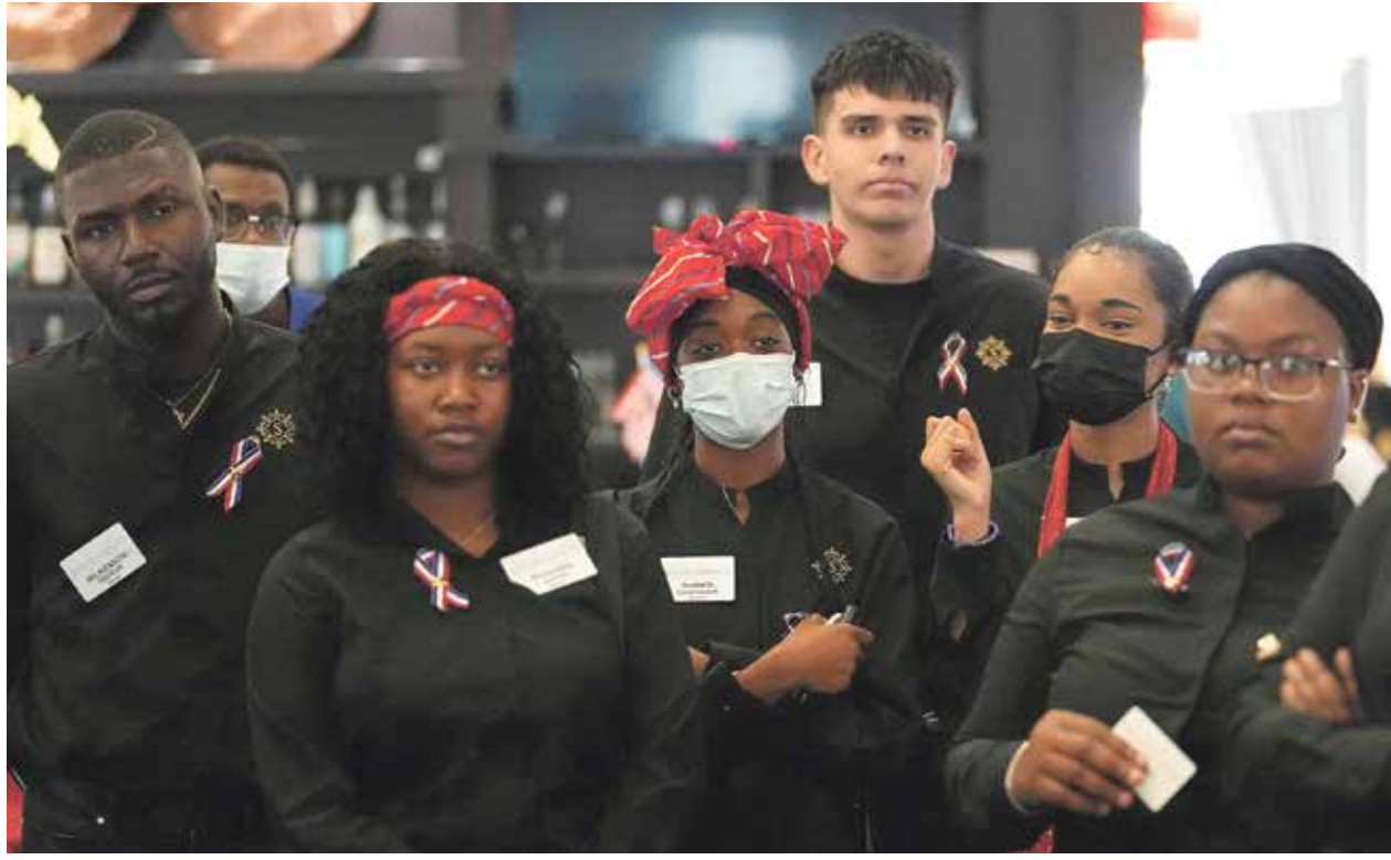
Dining room staff listened to instructions from their manager just before the start of an Independence Day buffet service at the Toby and Leon Cooperman Sinai Residences, an independent living community in Boca Raton, Fla.