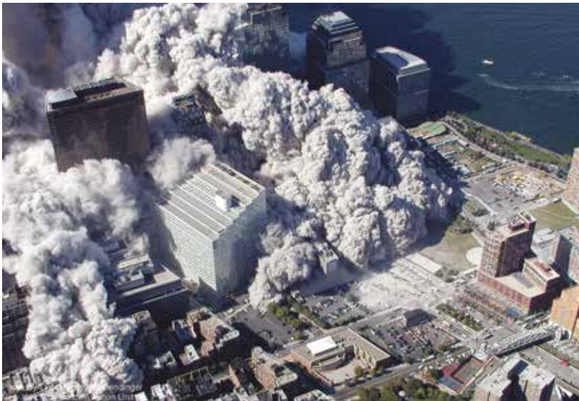
NYPD Detective Gregory Semendinger.