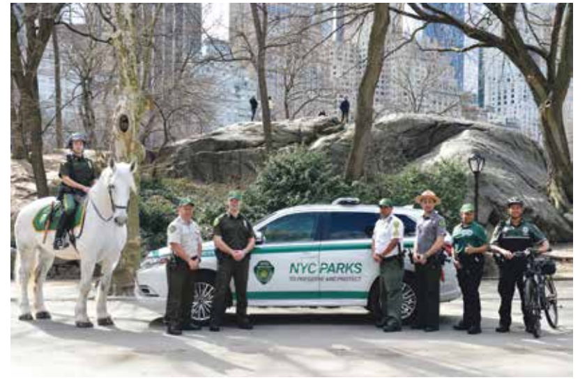
Department of Parks and Recreation

The retired cops and firefighters were eligible for an average pension of $98,011, according to the data, more than twice the $46,796 the nearly 12,000 new members of the state's Employees Retirement System averaged, the Empire Center said.