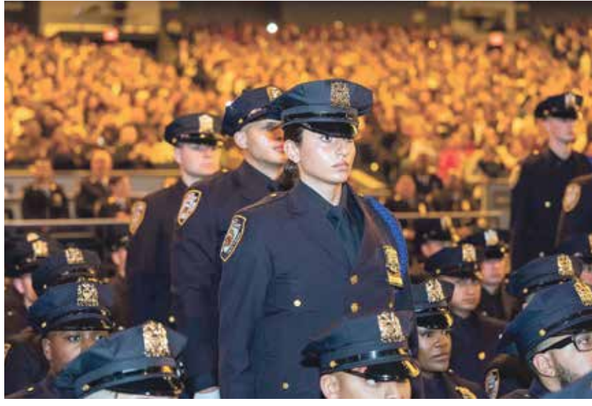
A few of the more than 550 NYPD recruits who graduated in May 2024. They were among the department's roughly 2,600 officers hired last year, not enough to replace the 2,951 cops who retired or quit last year.